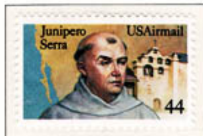
founded numerous missions throughout California