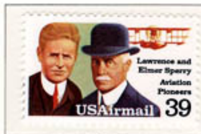
Aircraft Designers, First Seaplane