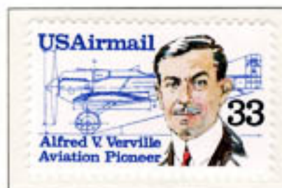
Inventor, Verville-Sperry R-3 Army Racer