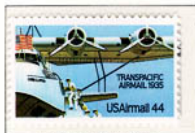
Martin M-130 "China Clipper"