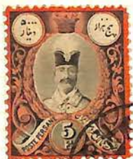
GENUINE. (PERF. 12).

THE PORTRAIT DESIGNS WERE ALL RECESS PRINTED IN THE ORIGINALS. IN THE LITHOGRAPHED FORGERIES ALL DETAIL IS COARSER AND THE BLACK BACKGROUND HAS NO SHADING AS IN THE ORIGINALS.