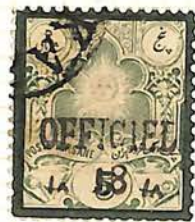
GENUINE. 180x5. P.12.