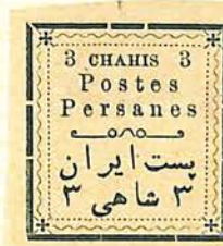
TALL "3" VARIETY