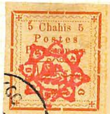
2ND. PRINT. STAMP 10.