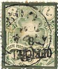
GENUINE. 80x5 P.13. 2 DOTS. OVPT. INVERTED.