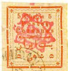
2ND. PRINT. STAMP 10.