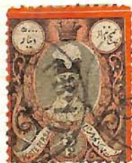
FORGERY. (PERF. 11 1/2).