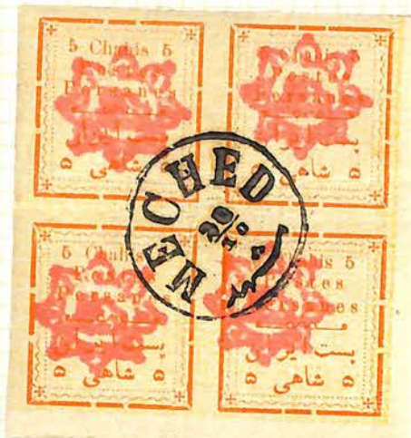
1ST. PRINTING. STAMP 9 IN BLOCK WITH 10, 11 AND 12.