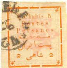
1ST. PRINT. STAMP 9.