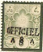
FORGERY. 80x5. P.12.