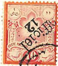
FORGERY. 120x10 P.12. OVPT. INVERTED.