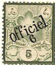
FORGERY. 60x5 2 DOTS P.12.