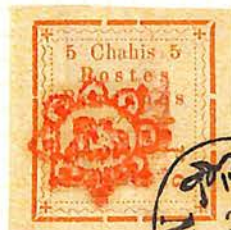
2ND. PRINT. NORMAL "5"