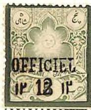
FORGERY. 120x5. P.12