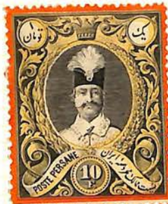
GENUINE. (PERF. 12).