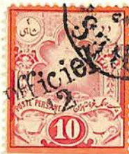
FORGERY. 120x10. P.12.