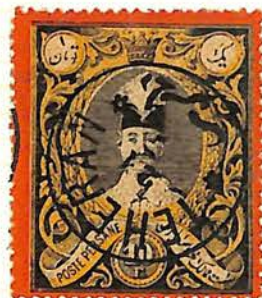
FORGERY. (PERF. 11 1/2).