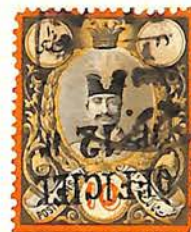
120x10. P.13 x 12 1/2. OVPT. INVERTED

50c. and 1fr. VALUES OF 1882 OVERPRINTED WITH "SUNBURST" DEVICE INCORPORATING THE FIGURE "5" AND HANDSTAMPED WITH AN ADDITIONAL CRUDELY FORMED "5". REGARDED AS BOGUS PRODUCTIONS. P.12.