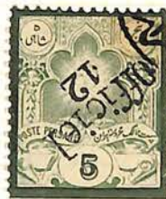
FORGERY. 60x5 3 DOTS. P.12 OVPT. INVERTED.