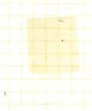
GENUINE. 120x5. P.13 x 12 1/2