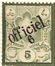
FORGERY. 60x5 3 DOTS. P.12.