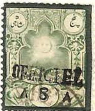
GENUINE. 80x5 P.12 1/2