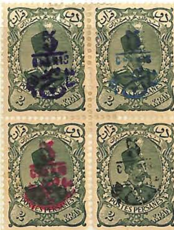
VIOLET GREEN RED BLACK