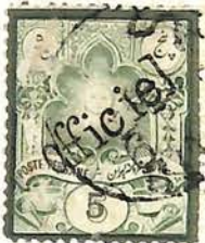
GENUINE. 60x5. 3 DOTS P.12. Bagus

UNAUTHENTICATED AND DOUBTFUL SURCHARGES ON STAMPS OF 1882 ISSUE, POSSIBLY GENUINE ERRORS, OR DONE BY FAVOUR, OR MERELY BOGUS. ~ "GENUINE" INDICATES SURCHARGE ON A GENUINE STAMP. "FORGERY" INDICATES SURCHARGE ON A FORGED STAMP.