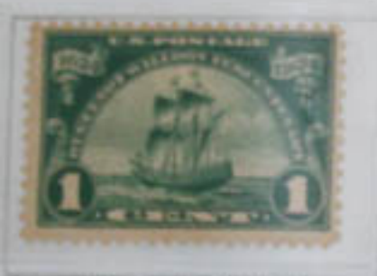
The "New Netherland"