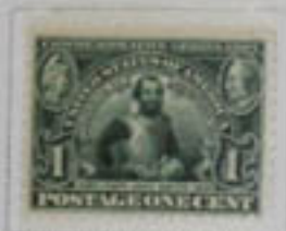
Captain John Smith