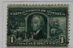
Robert R. Livingston