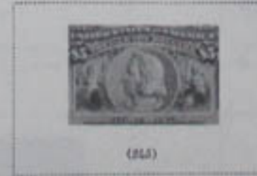
A commemorative half-dollar, issued for the Exposition, supplied this stamp portrait.