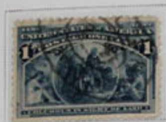
Oct. 12, 1492. Columbus' first sight of land. He thinks it is "the Indies."