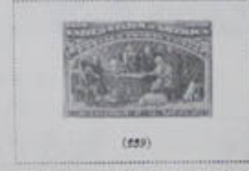
Columbus and the La Rabida monks debate his new plans to explore the "Indies."