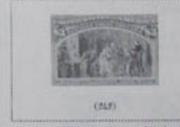
Released, he makes a third trip to the "New World", returns home to report triumph.