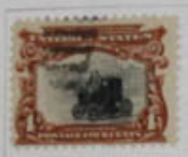
Salute to the infant auto industry that would do so much to mature our nation.