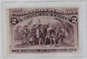
Still thinking it the Orient, he lands, naming it San Salvador (in the Bahamas.)