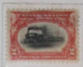
Iron rails helped pave the way to the "gold" of the untapped western wilderness.