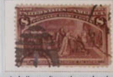
Isabella confirms the explorer's titles, authorizes a second voyage, to colonize.