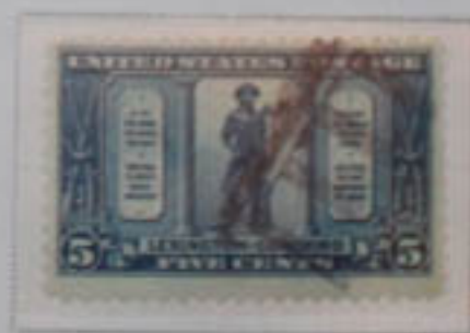
The Minute Man

On April 18, 1775, steadily worsening relations between England and her American colonies climaxed in armed conflict, when British redcoats under General Gage fired on the "Minutemen" at Lexington and in turn were strongly resisted by them at Concord. This set commemorates the 150th anniversary of the historic engagements. In July, General Washington took command of the rag-tag Continental army.