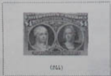
Isabella and Columbus; first stamp to feature a woman — and a non-American!