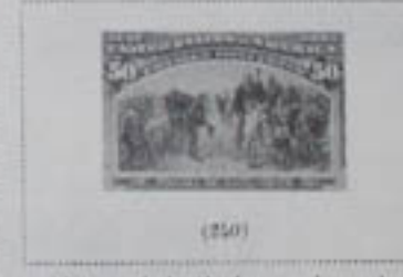
Although hailed as a hero by most, Columbus also attracted envy — and enemies.