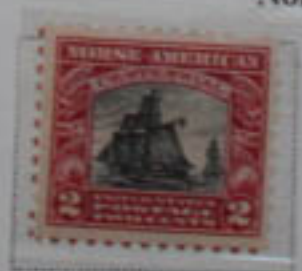
The Sloop "Restaurationen"