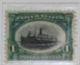
Fast Great Lakes steamers sped the bulk of goods between east and midwest.