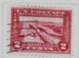
Pedro Miguel Locks