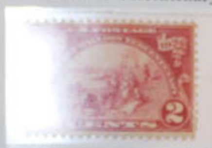
Landing at Ft. Orange