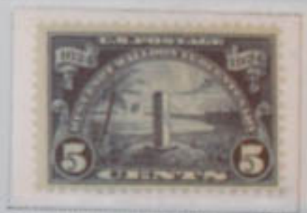
Huguenot Monument, Mayport, Fla.

Religious wars of the 16th and 17th centuries drove from France many Protestants, called Huguenots. Some landed at what is now Mayport, Fla., eventually to be wiped out by the Spaniards. In 1624, others, known as Walloons, came here via Holland on the "New Netherland," buying Manhattan Island from the Indians and founding Ft. Orange (now Albany, N. Y.) far up-river.