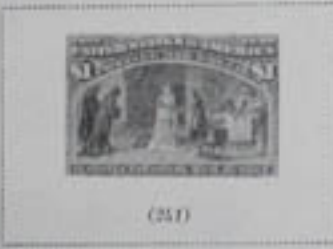
Queen Isabella offers to pawn her jewels to finance Columbus, but she doesn't have to.