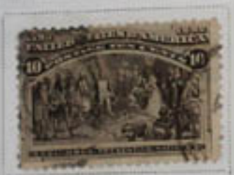
Columbus offers his King and Queen a rare gift: a few American Indians!