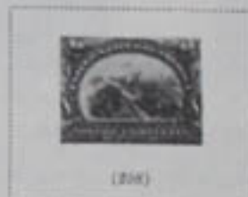
The Sault Sainte Marie canal linking lakes Huron and Superior via five giant locks.