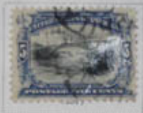
Physical and symbolic link with Canada, the single-span steel bridge below the Falls.