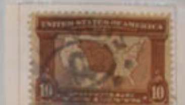
Map of Louisiana Purchase

The purchase of the Louisiana Territory from Napoleon in 1803, for $15,000,000, added over 800,000 sq. mi., more than doubling our size, as the stamp map shows. President McKinley approved the St. Louis World's Fair, observing the 100th Anniversary of the event. His likeness, that of then President Thomas Jefferson and negotiators Robert R. Livingston and James Monroe are also featured in this issue.