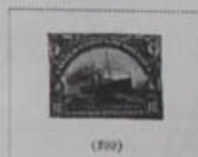
"Fast Ocean Navigation" depicts one of the finest U.S. liners afloat in those days.

The Pan-American Exposition opened on May 1, 1901, to cement feelings of solidarity and friendship between the American nations, from the Arctic to Cape Horn. Held in Buffalo, N. Y., it stressed Western Hemisphere progress in the 1800's. Some of the centers in the issue became reversed and are therefore prized as valuable rarities.