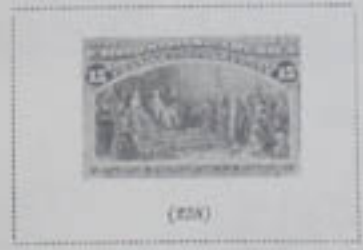
At Barcelona's great cathedral, Columbus explains his plans to colonize Hispanola.