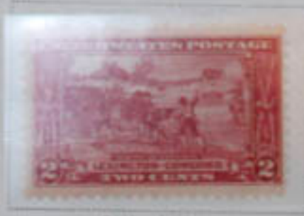
Birth of Liberty