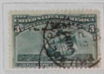
Columbus' flagship, the Santa Maria, 90 ft. long, one-tenth a modern liner's size!