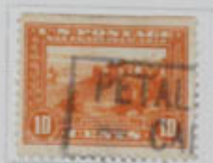
Discovery of San Francisco Bay