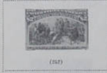
When his colonies fail, Columbus' enemies conspire to have him chained and jailed.