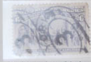
Barcelona acclaims Columbus, the hero, after his discovery of a "New World."