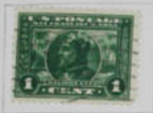
Vasco Nunez de Balboa