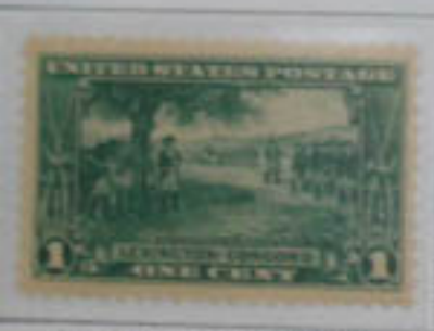
Washington at Cambridge