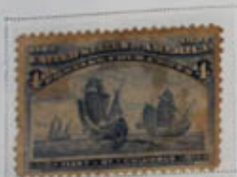
The Santa Maria and the even smaller Nina and Pinta; Columbus' tiny fleet.