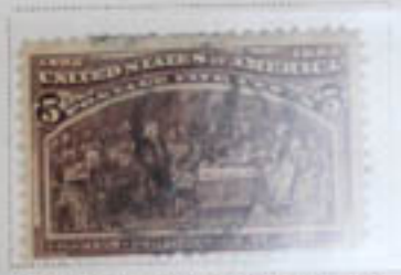
Columbus asks Ferdinand and Isabella, Spain's monarchs, to sponsor his trip.