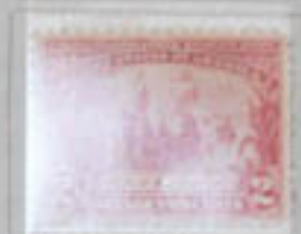
Founding of Jamestown