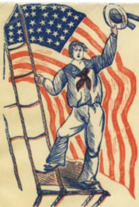
Three Cheers for the Red, White & Blue.