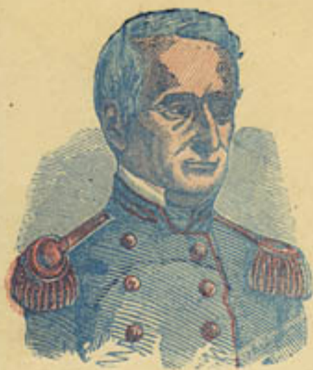
Col. Robert Anderson.

"Yes, sir, trusting in God, we shall succeed in the high and responsible task before us. I have no doubt at all of the ability of the Government to maintain the honor and the integrity of the Republic. I rejoice at the wonderful unanimity which I find pervading all classes everywhere, in my travels, in response to the maintenance of the Federal Union."—Extract from Col. Anderson's Speech, at Cincinnati, May 20th, 1861.