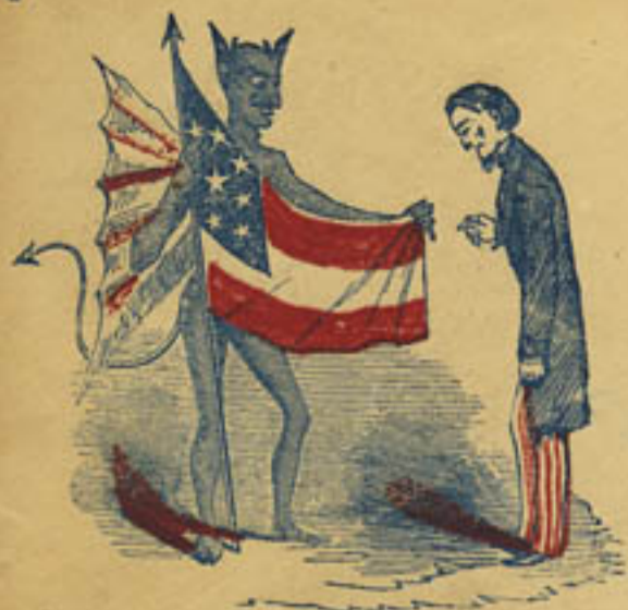
The original suggestion and adoption of the Confederate Flag.