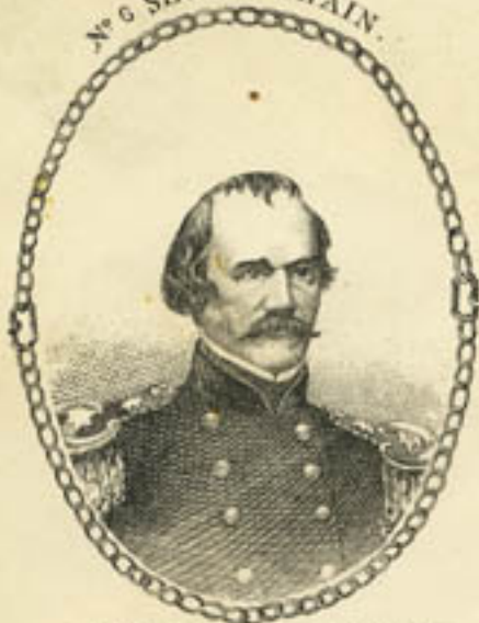
MAJ GEN A.S. JOHNSTON.