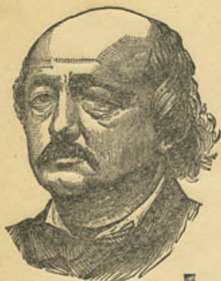
Gen. B. F. Butler.