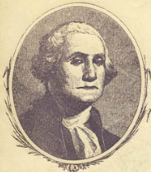
A SOUTHERN MAN WITH UNION PRINCIPLES.