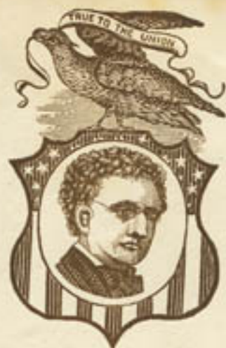
GOV. JOHN A. ANDREW.