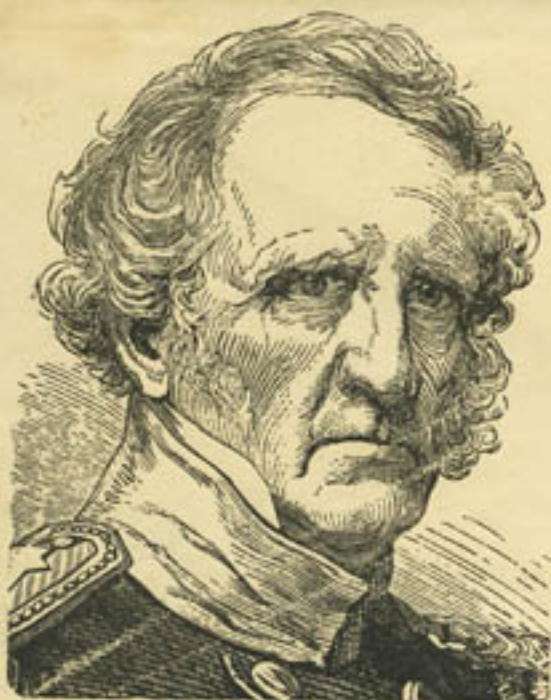
Lieut. Gen. Scott.

Day & Hollinghead, Electrotypers, 58 & 60 Fulton St. N. Y.