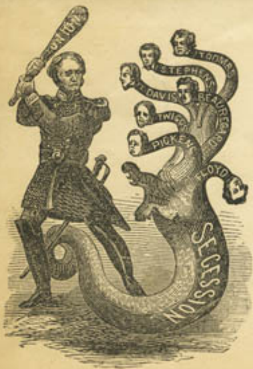
THE HERCULES OF 1861.