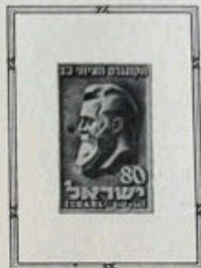
Dr. Theodor Zeev Herzl

Dr. Theodor Zeev Herzl, whose portrait appears on this stamp, was the founder of the Zionist movement. The stamp was issued for the 23rd Zionist Congress held in Jerusalem during August 1951. Dr. Herzl was the initiator of the First Zionist Congress held in Basel, Switzerland in 1897.