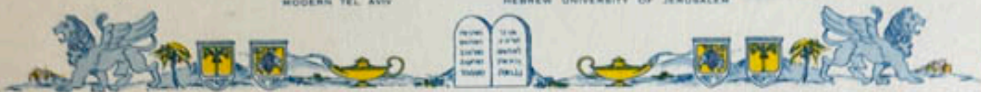
HEBREW UNIVERSITY OF JERUSALEM