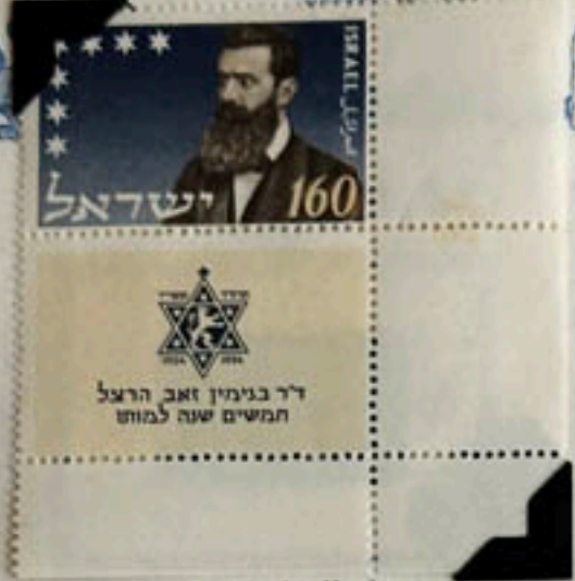
Dr. Theodor Herzl

Dr. Herzl, whose likeness is shown on this stamp, founded the World Zion Movement to which he dedicated his life. Born in Hungary, he lived as a journalist and author in Paris and Vienna where he died in 1904. Dr. Herzl's remains were brought to Vienna and reburied in Jerusalem in 1949.