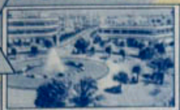
MODERN TEL AVIV