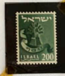
Emblem of Joseph