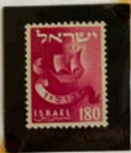
Emblem of Zebulun