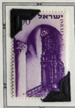
Holy Ark, Safed

This is the Sixth special issue of Festival Stamps prepared by the Israel Post Office. The motifs for this issue are the Holy Arks of three Israel Synagogues. The Ark depicted on the 20 pruta stamp was located in the 17th century Baroque Synagogue which originally stood in Conegliano Veneto in Italy and was brought to Jerusalem in 1852.