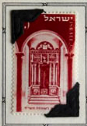
Holy Ark, Petah Tikva