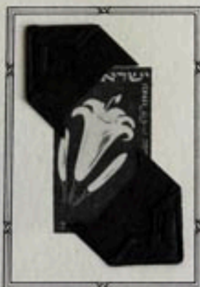
Rose of Sharon