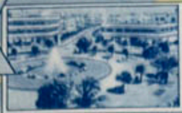
MODERN TEL AVIV