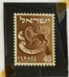
Emblem of Judah