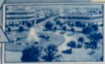
MODERN TEL AVIV