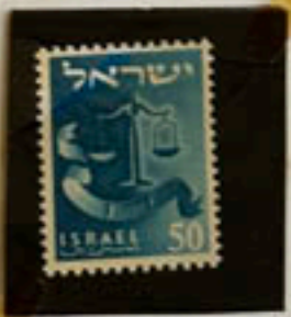
Emblem of Dan