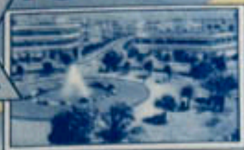
MODERN TEL AVIV