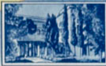
HEBREW UNIVERSITY OF JERUSALEM