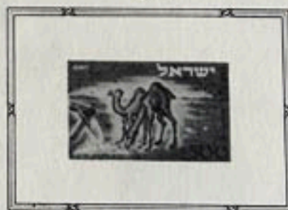
Camels in Negev

This 500 pruta stamp shows a reproduction of Beuren Rubin's picture, "The Negev" and forms a part of the first definitive series of postage stamps for Israel. The stamp was issued on the occasion of the opening of the Eilat Post Office on the southernmost point of the Negev.