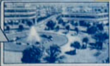
MODERN TEL AVIV