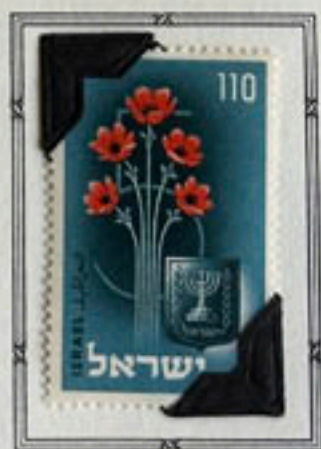
Anemones & State Insignia

To commemorate the fifth anniversary of the Proclamation of the State of Israel, this 110 pruta stamp was placed on sale April 19, 1953. The design depicts five anemones and the insignia of the State.