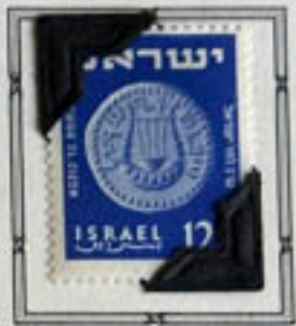
Second Year of the Freedom of Israel

Additional denominations to the current definitive Coinage series, the designs feature ancient and religious coinage of 100-76 B. C. E., 68-70 A. C. E. and 132-135 A. C. E.