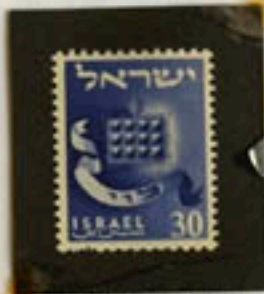
Emblem of Levi