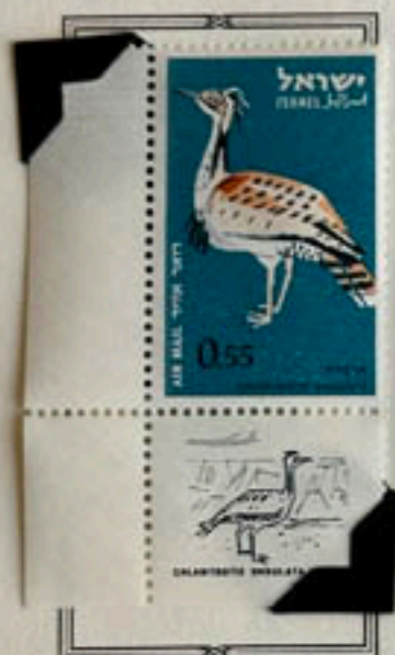
The Hubara Bustard