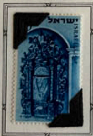
Holy Ark, Jerusalem