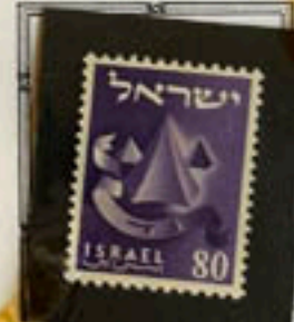
Emblem of Asher