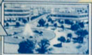
MODERN TEL AVIV