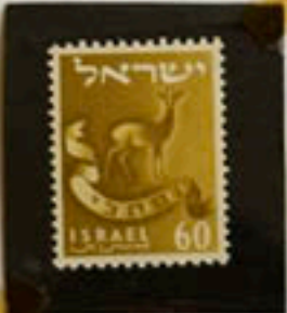
Emblem of Naphtali