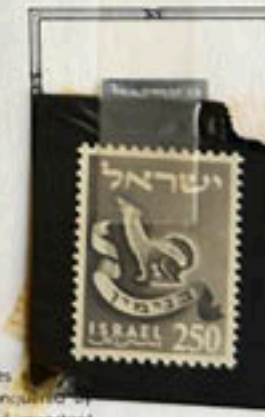
Emblem of Benjamin

Each of the stamps in this set shows the emblem of one of the Twelve Tribes. The Tribes correspond to the twelve sons of Jacob (Gen. 29, 30, 35, 18). When the country was conquered by Joshua, it was divided between the Twelve Tribes. Only the Tribe of Levi, which was allotted important tasks in the Temple Services, was not given an inheritance of its own.