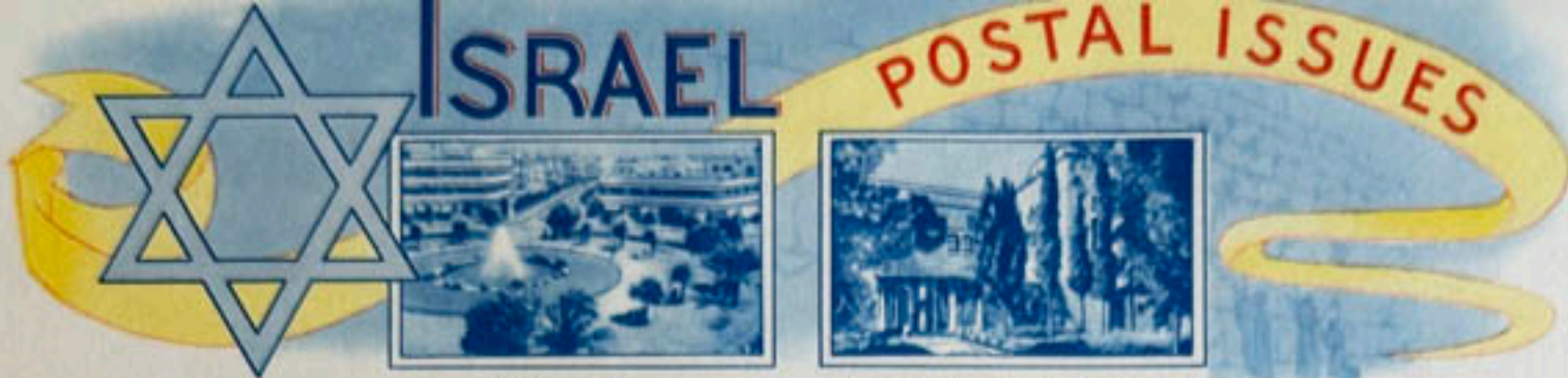
MODERN TEL AVIV