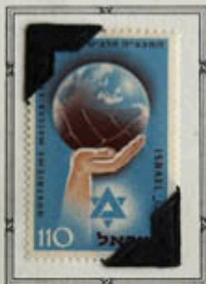
Hand & Ball

The Seventh International Congress of the History of Science was held in Jerusalem from August 4th to 11th, 1953. The special stamp issued in compliment to the Congress bears a portrait of Rabbi Moshe Ben Maimonides (1135-1204, physician, philosopher, and famous author of "Guide of the Perplexed").