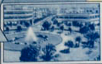
MODERN TEL AVIV