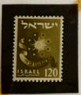
Emblem of Issachar