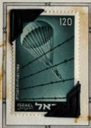
Parachutist in Action

This stamp honors the mobilization of the Yishuv during the Second World War. The design depicts a soldier parachuting behind enemy lines and symbolizes the heroism of Jewish volunteers—more than 30,000 strong—who answered the call and eventually formed the Jewish Brigade.