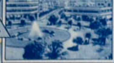
MODERN TEL AVIV