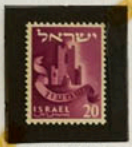
Emblem of Simeon