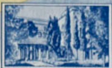
HEBREW UNIVERSITY OF JERUSALEM