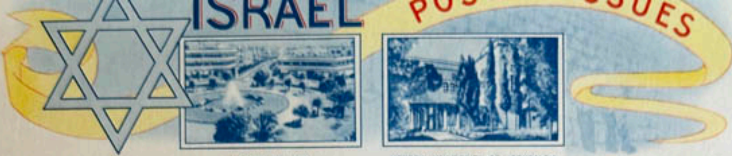
MODERN TEL AVIV