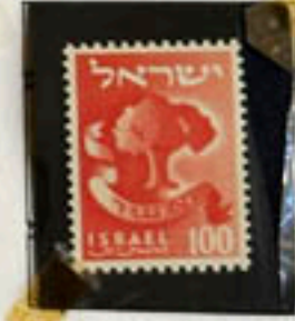
Emblem of Aizer