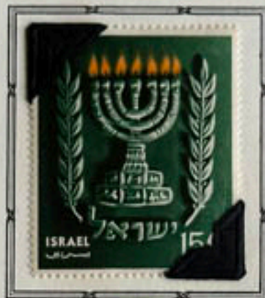
Emblem of Israel

Honoring Memorial Day and the Seventh Anniversary of the proclamation of the State of Israel, this stamp was issued on April 26, 1955 and depicts the emblem of Israel with the seven arms of its Menora lighted, thus symbolizing the completion of seven years of independence.