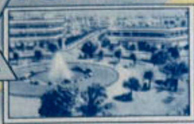
MODERN TEL AVIV