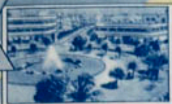
MODERN TEL AVIV