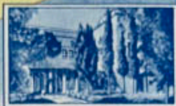
HEBREW UNIVERSITY OF JERUSALEM