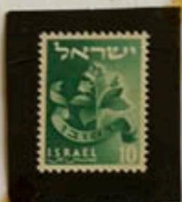
Emblem of Reuben