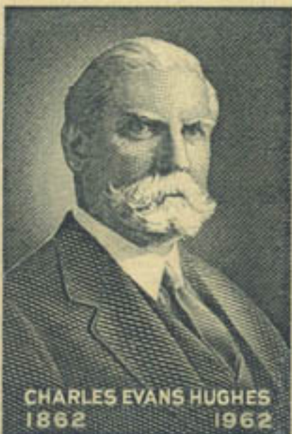
CHARLES EVANS HUGHES 1862 1962