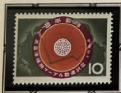
Cable on Pacific Map

This stamp was released on June 19th to mark the completion of the laying of a transpacific cable . . . a joint venture of Kokusai Denshin Denwa Co., Ltd. and the American Telephone and Telegraph Company.