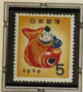
Toy of Takamatsu