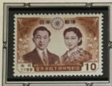
Prince Akihito & Princess Michiko