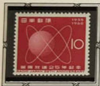
Radio Waves Around Globe

The year 1960 marked the twenty-fifth anniversary of JBC overseas broadcasting. It was on June 1, 1935 that service was inaugurated in English and Japanese.