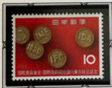
Images of Five Coins

Issued to commemorate the meeting of the International Monetary Fund which was held in Tokyo September 7-11, 1964. The gathering was the largest to ever attend on IMF general meeting.