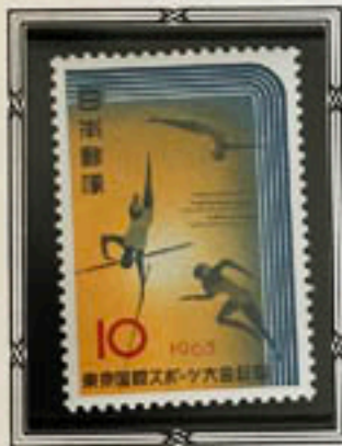
Diving, Pole Vaulting and Relay Running

The Tokyo International Sports Week, which served as a rehearsal for, and covers all 20 events of the 1964 Tokyo Olympics, opened at 23 stadiums on October 11, 1963. This stamp was issued in commemoration of the event.