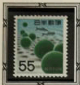
Water Plants, Lake Akan