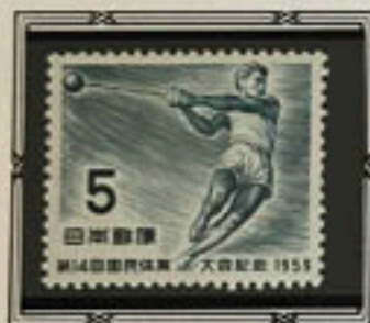
Throwing the Hammer

The National Athletic Meetings are held for the purpose of popularizing sports, promoting the spirit of amateur sportsmanship and elevating the health of the nation. This set was issued for the 14th Meeting.