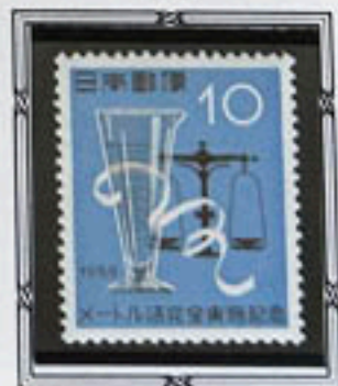
Measuring Glass, Tape Measure & Scales

The Japanese adopted the metric system on January 9, 1959 and to celebrate the event, this stamp was released on June 5, 1959.