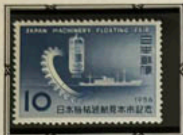
Cogwheel, Vacuum Tube & Ship

Issued to publicize the Japanese Machinery Floating Fair - a ship equipped with a large assortment of Japanese-made machines for demonstration purposes.