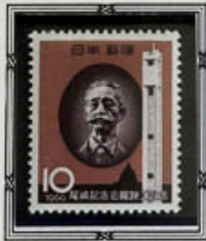
Yukio Ozaki & Clock Tower

Issued to commemorate the completion of Ozaki Memorial Hall to perpetuate the memory of Yukio Ozaki (1858-1954), famous for his work with parliamentary government in Japan.