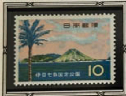
View of Hachijojima

The Izu Island Quasi-National Park, which forms part of Greater Tokyo, consists of seven islands that extend north and south in the Pacific Ocean. This stamp features a view of Hachijojima with a phoenix tree in the foreground.