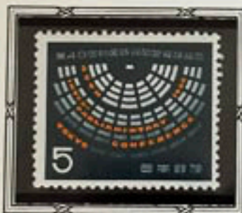
Seating Plan of Diet