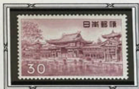
Phoenix Hall, Byodo-in Temple