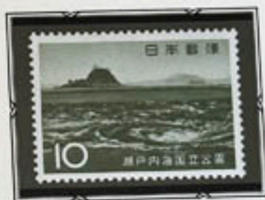
Whirlpool at Naruto

The Inland Sea of Japan is an enticing stretch of landlocked waters studded with some 600 islands of various sizes and shapes and connecting with the outside seas by the four straits of Kitan, Naruto, Bunyo and Kanmon.