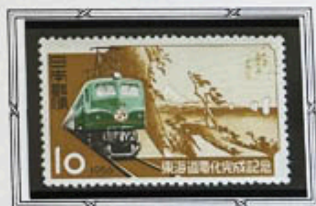
Electric Locomotive and Hiroshige Plant

This stamp commemorates the completion of the electrification of the Tokaido Line.