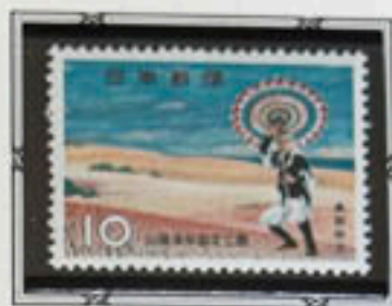
Parasol Dance on Dunes

The San'in Kaigan Quasi-National Park consists of a strip of landscape along the Sea of Japan extending over the three prefectures of Kyoto, Hyogo and Tottori.