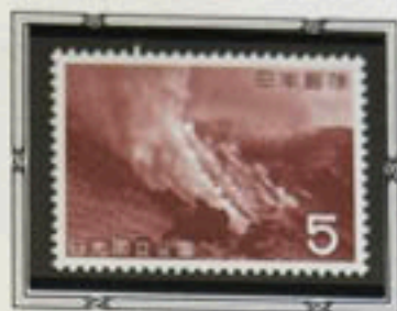
Smoke from Mt. Chausu