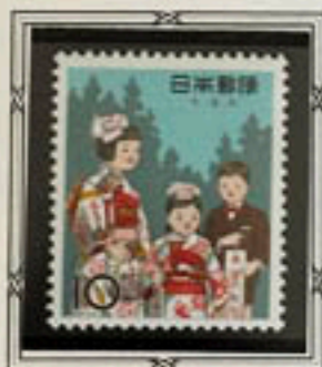
Children in Party Dress

The 15th of November is called Shichigosan. On that day Japanese boys of five and girls of three and seven years of age are taken to shrines to pray for their unhindered growth to blessed manhood.