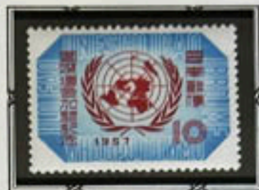
United Nations Emblem

Japan was admitted to the United Nations in 1956. This stamp was issued on the first anniversary.