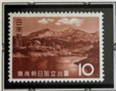
Lake Hibara and Mt. Bandai

The Bandai-Asahi National National Park, so designed on Sept. 5, 1950, extends over the three prefectures of Yamagata, Fukushima and Niigata, and consists of four regions — the so-called Three-Mountains of Dewa, the Iide mountain range, and the Azuma mountain range.