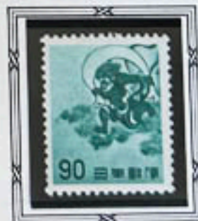
"The Wind God"

Released July 2nd, this design features the "The Wind God" by Sotatsu Tawaraya. It is considered one of his greatest masterpieces.