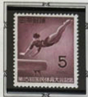
Girl Gymnast - Vaulting Horse

The 15th National Athletic Meeting had its winter contests in Nagano prefecture and the summer contests in Kumamoto.