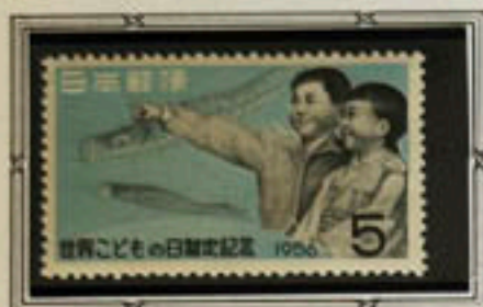
Boy and Girl with Paper Carp

Issued to commemorate the establishment of World Children's Day, May 5, 1956.