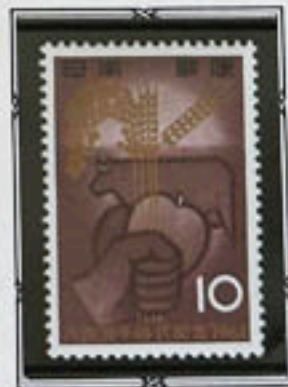
Ears of Grain, Fruits and a Cow

The reclamation of Hachirogato lagoon was the largest of its kind in Japan and showed the general trend of Japan's modern agriculture. This stamp was issued September 15th when a draining ceremony was held to mark the completion of the work.