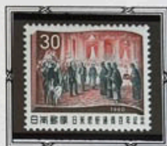
Pres. Buchanan Receives Japanese Mission