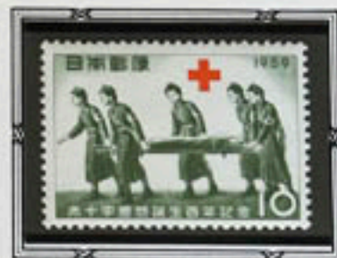
Nurses Carrying Stretcher

Issued to mark the 100th anniversary of the philanthropic work of Henri Dunant. It was on June 24, 1859, on the battlefield of Solferino, that he conceived the idea of an International Red Cross.