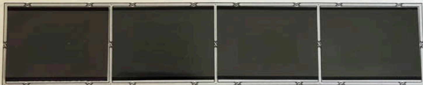
Mt. Fuji from Lake Ashi