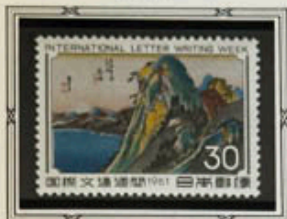
"Hakone," Print by Hiroshige

This stamp marks International Letter Writing Week 1961 and features woodcut art. For its design the print, "Hakone" was used . . . from the "Fifty-three Stages of Tokaido" series by Hiroshige Ando (1797-1858), ukiyo-e artist of the later Edo period.