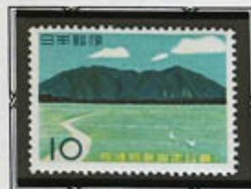
Mt. Yabiko & Echigo Plain