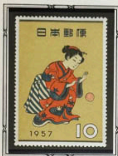
"Girl Bouncing Ball"

The centenary of the Japanese iron industry was commemorated by the issue of this 10 yen stamp.