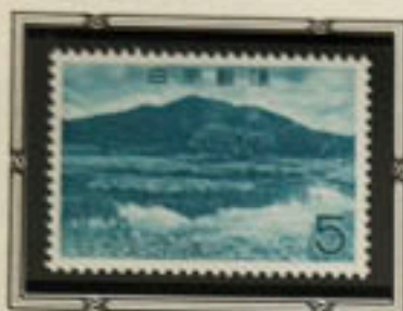
Ozeegahara Swamp & Mt. Shibutsu