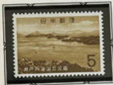
View of Wasbu