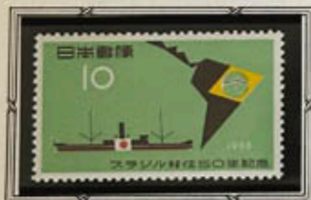
Ship, Map and Brazilian Flag

This stamp commemorates fifty years of Japanese emigration to Brazil.