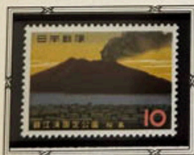
Sakurajima Volcano & Bay

The Kinkowan Quasi-National Park consists of three regions around Kagoshima Bay. Favored with sunshine and a superb view, it is said to be the most beautiful bay in Japan.