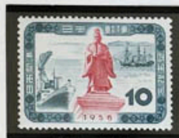
Statue and Harbor

Issued to commemorate the centenary of the opening of the ports of Yokohama, Nagasaki and Hakodate to foreign nations.