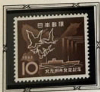
City Map, Birds, Ship Factory

This stamp commemorates the merging of the five cities of Moji, Kokura, Wakamatsu and Tabata in Fukuoka Prefecture. With a population of one million, the new merged city is known as Kito-Kyushu City.