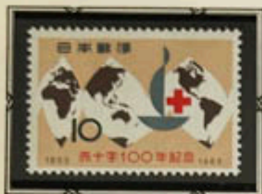
Map & Centenary Emblem

Issued to mark the founding of the International Red Cross at Geneva in 1863. This design, by Saburo Watanabe of Tokyo, features the World Map and the Red Cross Centenary emblem.