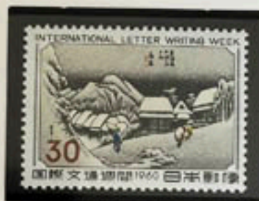
"Kambara," Print by Hiroshige

Issued October 9, 1960, this stamp commemorates International Letter Writing Week. The design features woodcut art . . . the print "Kambara" from the "Fifty-three States of Tokaido" series by Hiroshige Ando.