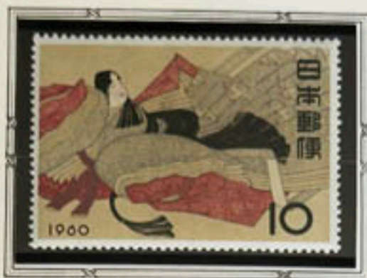
Poetess Ise, 13th Century Painting

Issued for Philatelic Week, 1960, this stamp was released on April 20, and has for its design the portrait of poetess Ise, reproduced from the "thirty-six-poet series" of paintings ascribed to Nobuzane Fujiwara, who flourished in the mid-13th century.