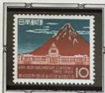
"Red Fuji" by Hokusai

The 49th Conference of the Inter-Parliamentary Union took place in the Diet Building, Tokyo, September 29 through October 7, 1960. The first such conference was held in Paris in 1889.