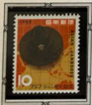
Hat & Map of Southeast Asia

More than 25,000 Boy Scouts from various Asian nations gathered on the gentle slopes of Mt. Fuji for a four-day Jamboree, August 3, 1962.