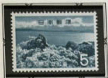
"Frost Flowers" on Mt. Fugen

Originally designated as Unzen National Park on March 16, 1934, its bounds were enlarged on July 20, 1956 to include part of Amakusa Islands under the new name of Unzen-Amakusa National Park. It covers an area of 25,600 hectares and is one of Japan's most beautiful.