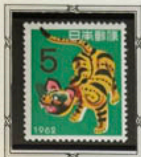
Papier Mache Tiger

This stamp marks the year of the Tiger and pictures a papier-maché toy tiger. In Izumo, Shimane Prefecture, there is an old custom of decorating houses with the form of a tiger as a charm against evil spirits.