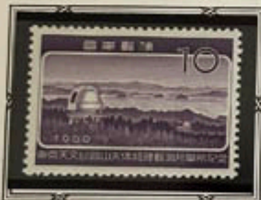
Okayama Astrophysical Observatory

The Okayama Astrophysical Observatory completed a 74-inch reflecting telescope during the year 1960. This stamp was issued in celebration.