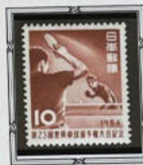
Table Tennis Players

This stamp was issued to publicize the International Table Tennis Championships, Tokyo, April 2nd through 11th, 1956.