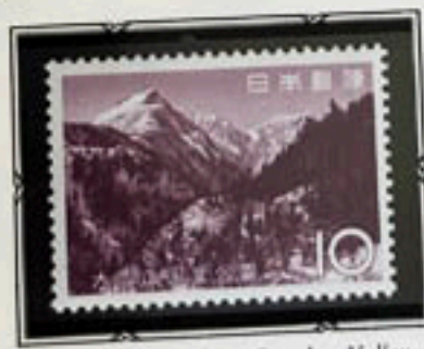
Mt. Kurodake from Sounkyo Valley

The Daisetsuzan National Park occupies the central heights, the mountainous region commonly called the roof of Hokkaido. With an aggregate area of 231,929 hectares, it is the largest national park in Japan. It was designated a National Park on December 4, 1934.