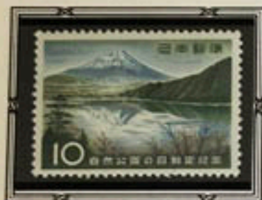
Mt. Fuji and Lake Motosu

This stamp was released during the National Park Convention which was held at Yumoto, Nikko, on July 21, 1959.