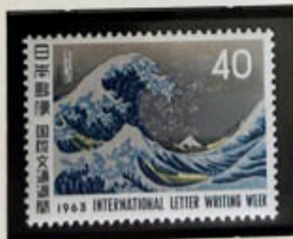
Waves off Kanagawa by Hokusai

Commemorating International Letter Writing Week, this stamp pictures a piece of Japan's unique art of wood-block printing. This one is taken from the "Thirty-six Views of Mt. Fuji" by Hokusai Katsushika (1760-1849).