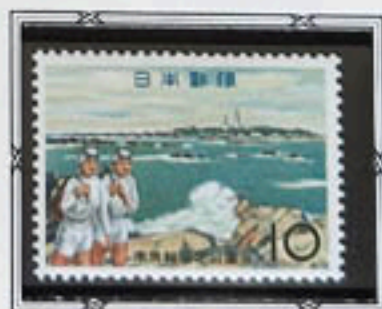
Nojima Cape Lighthouse & Fisherwomen

The Minami-Boso National Park comprises a narrow strip of land along the seashore of the southern half of