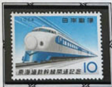
Super Express Electric Train

The opening of the new Tokaido Line took place on October 1st. It was built to alleviate the mounting traffic problem on the old Tokaido Line of the Japanese National Railways which links the three great industrial and cultural centers of Tokyo-Yokohama, Nagoya, and Kyoto-Osaka-Kobe.