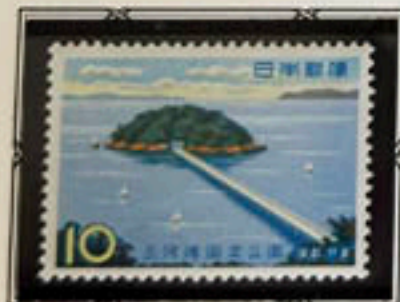
Takeshima, off Gamagori

The Mikawa Bay National Park consists of an expanse of waters embraced within the two arms of Chita and Atsumi peninsulas together with its surrounding land strips.