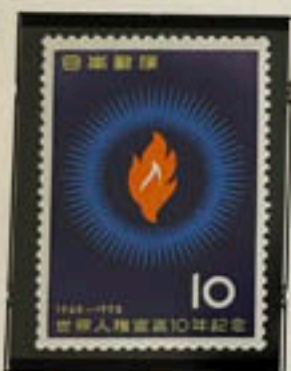
Flame: Symbol of Human Rights

This stamp was placed on sale December 10, 1958 to commemorate the tenth anniversary of the Universal Declaration of Human Rights.