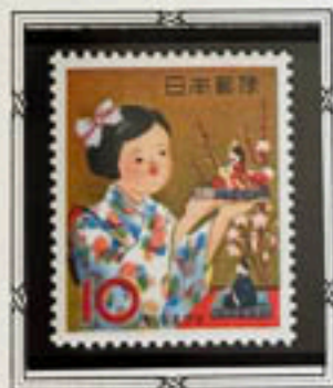
Hinamatsuri, Doll Festival

Hinamatsuri (Doll Festival) is an occasion celebrated by parents on March 3rd with dolls, rice cakes, peach blossoms and unfiltered sake to wish their young girls blissful growth to happy womanhood.