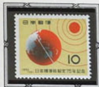
Sun, Earth and Meridian

The 75th anniversary of the institution of Standard Time in Japan is commemorated by this stamp released on July 12, 1961.