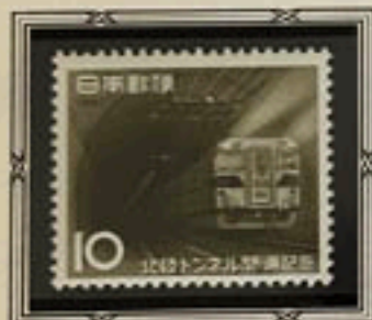
Train Emerging from Tunnel

This stamp commemorates the completion of the Tunnel between Tsuruga and Imajo on the Kokuriku Line of the Japanese National Railways. It was designed to speed up and augment the capacity of the Line.