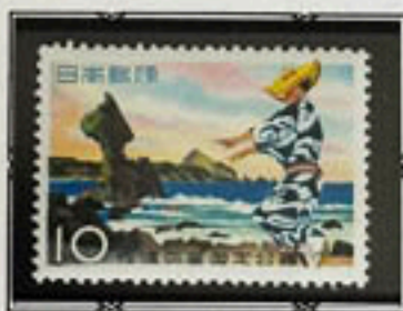
Sado Island & Local Dancer