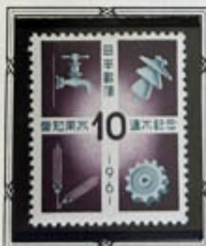
Faucet, Wheat, Insulator & Cogwheel

Released July 7, 1961, this stamp commemorates the completion of the Aichi Irrigation System.