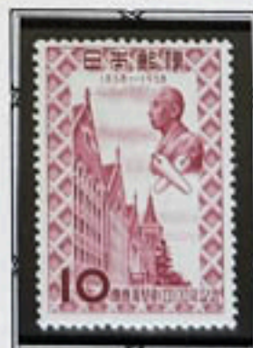
Keio University & Yukichi Fukuzawa

Issued to commemorate the centenary of the founding of Keio University.