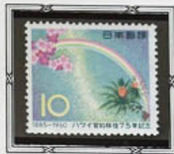
Cherry Blossoms, Pineapples and Rainbow

Issued to commemorate the 75th anniversary of Japanese immigration to Hawaii pursuant to a contract concluded between the Royal Hawaiian Government and the Japanese Government.