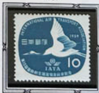
Crane and IATA Emblem