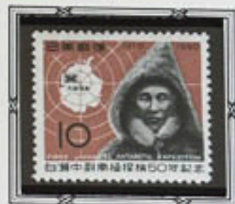
Explorer and Map of Antarctica

Issued to commemorate the 50th anniversary of Lieutenant Shirase's Antarctic Expedition. It was on November 10, 1910 that the sailing vessel Kainan Maru started on its trip . . . the first Japanese expedition to the Antarctic.