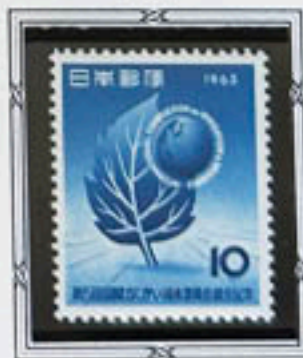
Globe and Leaf

The Fifth International Congress on Irrigation and Drainage was held in Tokyo May 13 through May 21, 1963 under the auspices of the Japanese Government.