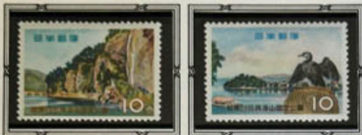
Ao Cave Area of Yabakei