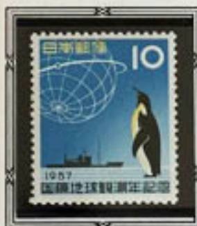
I. G. Y. Emblem, Penguin & Boat

Issued to commemorate the International Geophysical Year.