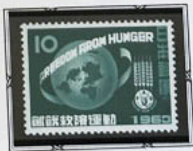
Wheat Emblem and Globe

To free the world from hunger and poverty, the United Nations Food and Agriculture Organization (FAO) conducted a campaign known as FREEDOM FROM HUNGER for which this stamp was released.