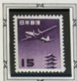
Pagoda and Douglas Plane

Picturing a Douglas plane and a five story pagoda, this stamp was released to cover a revision in foreign mail postage rates on April 2, 1962.