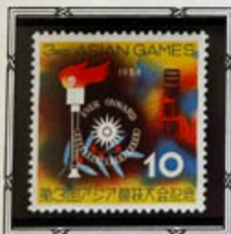
Torch and Emblem