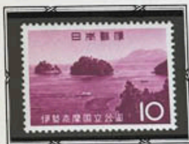
View of Toba

The Ise-Shima National Park occupies that part of Miye Prefecture which projects eastward into the sea. It abounds in scenic inlets and islets, and is known for the Grand Shrines of Ise. Pearl culture is practiced in its bays and coves.