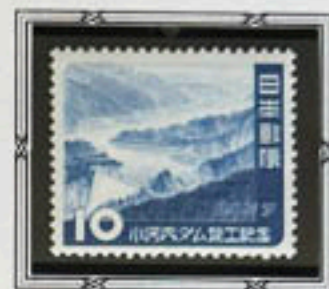
Lake Okutama & Ogochi Dam

Issued to commemorate the completion of the Ogochi Dam, which is part of the Tokyo system of water supply.