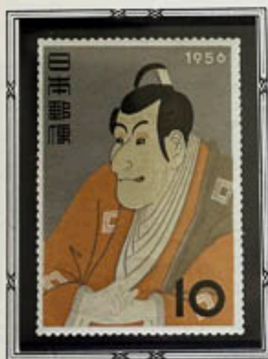
Actor Ichikawa Ebizo

On May 9th and 11th, 1956, a Japanese expedition successfully climbed Mount Manaslu in the Himalayas. This stamp commemorates the great feat.