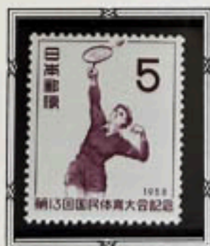
Girl Badminton Player

This set was issued to mark the 13th annual National Athletic Meeting at Toyama Prefecture.