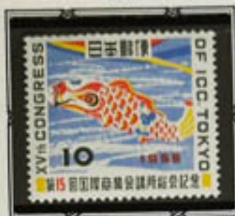
Paper Carp as Flows on Boys' Day

The 15th congress of the International Chamber of Commerce was held in Tokyo, May 16-21, 1955.