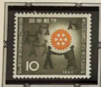
Rotary Emblem & People

This stamp commemorates the 52nd Rotary International Convention held in Tokyo in May, 1961.