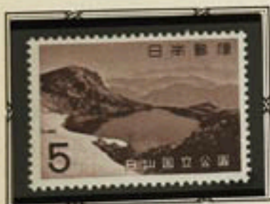
Green Pond, Midorigaike

The Hakusan National Park extends over the four prefectures of Ishikawa, Fukui, Toyama and Gifu, and covers an area of 47,402 hectares. It is a superb natural mountain park. The set of two stamps was placed on sale March 1, 1963.