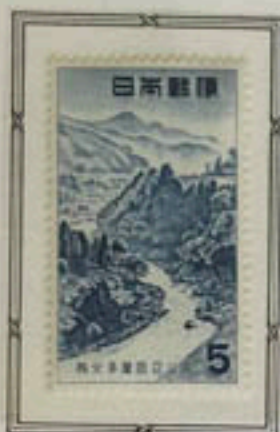
Mountains Stream, Tama Gorge