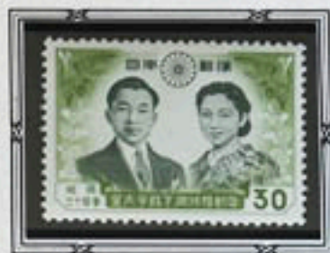
Prince Akihito & Princess Michiko

This set was issued to mark the wedding of H. I. H. Crown Prince Akihito and Miss Michiko Shoda and was released on April 10, 1959, the wedding day.