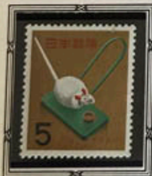
Toy Mouse of Kanazawa

Komekui-nezumi, the rice-eating mouse, is featured in the design of this New Year Stamp.