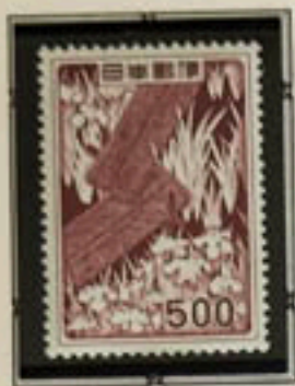
Bridge and Iris