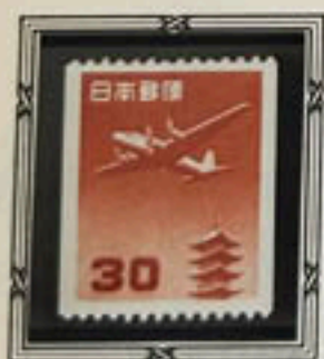
Pagoda & Plane