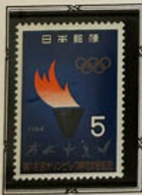
Olympic Caldron & Athletes

The stamp commemorates the Eighteenth Olympics and was released the day the sacred torch arrived in Japan to start a relay journey through the country. It was placed on sale September 9th.