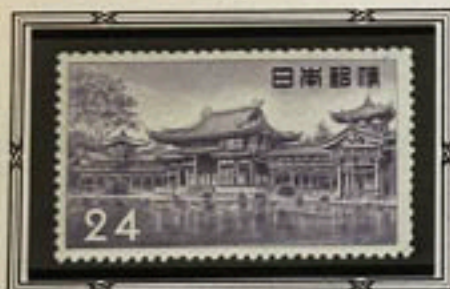
Phoenix Hall, Byodo-in Temple