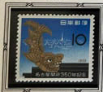
Golden Dolphin, Nagoya Castle

Issued for the 350th anniversary of the founding of Nagoya, Nagoya is identified with its castle. From the beginning it was famed for the pair of golden dolphins which adorn the roof ridge of its central tower.