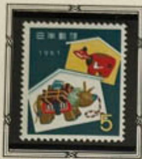
Red Calf and Gold Calf

The Golden Bekokko (bull or cow) is a local toy of Iwate Prefecture made in the likeness of the beast of burden. The Red Beka, a similar toy produced in Fukushima Prefecture, is prized as a charm. Both appear on the 1961 New Year stamp.