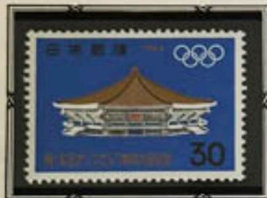
Nippon Budokan Hall

Released on October 10th, this set of four stamps marks the opening of the XVIII Olympiad in Tokyo. In addition to the stamps in sheet form, a special souvenir sheet was released.