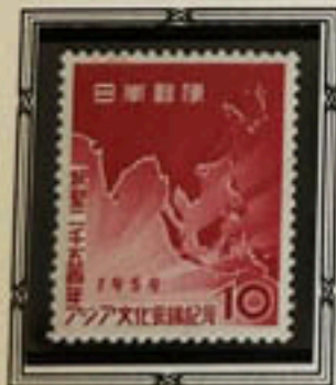
Map of South-East Asia

To improve friendly relations with Asian countries and thereby contribute to world peace an Asian Cultural Congress was held in March, 1959. The Congress also marked the 2,500th anniversary of Buddha's Death.