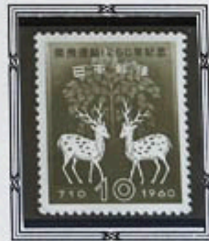
Nara Period Artwork

This stamp marked the 1250th anniversary of the transfer of the capital of Japan to Nara. In 710, Empress Genmyo transferred the seat of her government from Kashiwara to Nara.