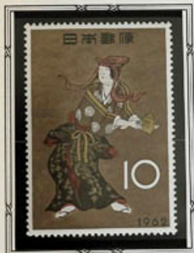
"Flower Viewing Party"

For Philatelic Week 1962, this stamp picturing a portion of the painting, "Flower Viewing Party", was released. The work of Naganobu Kono (1577-1654) the original painting is a six-panel folding screen depicting an outdoor merrymaking carnival of the feudal age.