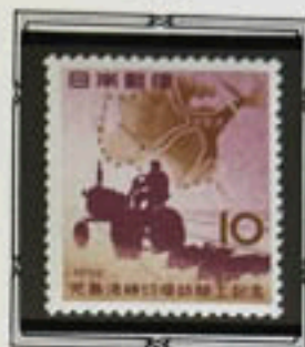
Tractor & Map of Kojima Bay

The creation of an embankment to reclaim Kojima Bay, Okayama Prefecture for farmland, was the subject for this stamp marking the completion of work. It was placed on sale February 1, 1959.