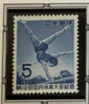
Girl on Parallel Bar