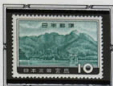
Torii of Itsukushima Shrine

This Scenic Trio set features three of Japan's breathtaking natural beauty spots: Bay of Matsushima, the Bay and shrine at Miyajima, and the Bridge of Heaven (Amano-Hashidate).