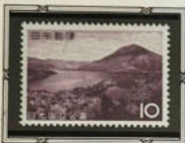
Lake Chuzenji & Mt. Nantai