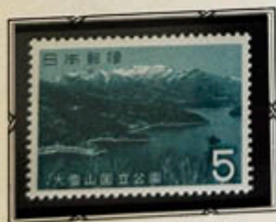
Lake Shikaribetsu, Hokkaido