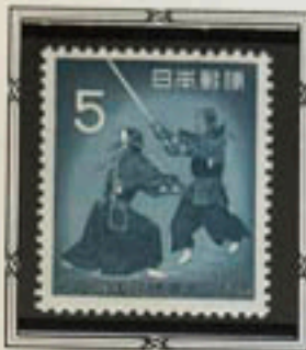
Japanese Fencing (Kendo)

The 15th National Athletic Meeting had its winter contests in Nagano prefecture and the summer contests in Kumamoto.