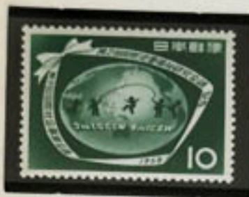
Globe and Playing Children

Issued to commemorate the Second International Study Conference on Child Welfare, November 23-27, 1958 and the Ninth International Conference of Social Workers, November 30th through December 6, 1958.