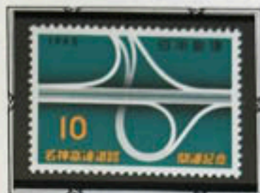
Intersection at Ritto, Shiga

Issued to mark the official opening of the Nagoya-Kobe Expressway that links the Kyoto - Osaka - Kobe region with Nagoya. It is a superhighway of the finest in the history of Japan's road program.