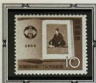
Shoin Yoshida & PTA Symbol

Issued for the National PTA Convention and for the 100th anniversary of the death of Shoin Yoshida, the great educator and forerunner of Meiji Restoration. The convention was attended by 7,000 teachers.