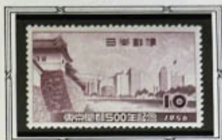
Palace Moat & Modern Tokyo

The year 1956 marked the 500th anniversary of the founding of Tokyo for which this stamp was issued.