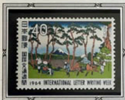
Mt. Fuji from Tokaido Highway

Issued to commemorate International Letter Writing Week 1964 which began on October 4th. The stamp reproduces a print from the "Thirty-six Views of Mt. Fuji" by Hokusai Katsushika (1760-1849) — Japan's unique art of woodblock painting.