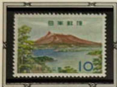
Onuma Lake and Volcano

The Onuma Quasi-national Park occupies the southeastern part of Oshima Peninsula, Hokkaido and comprises, within its bounds, the active Komagatake volcano and the three barrier lakes of Onuma, Konuma and Junsai-numa.