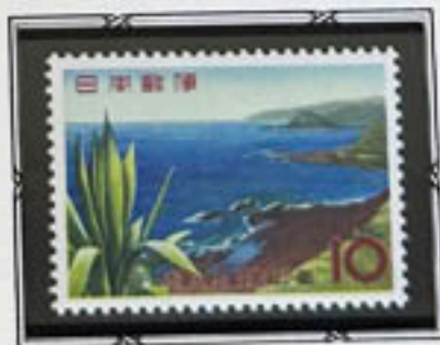
View from Horikiri Pass

The Nichinan-Kaigan Quasi-National Park extends over the two prefectures of Miyazaki and Kagoshima, and consists of two sections — one from Aoshima to Cape Toi and the other from Cape Toi to Cape Shikoku Bay.