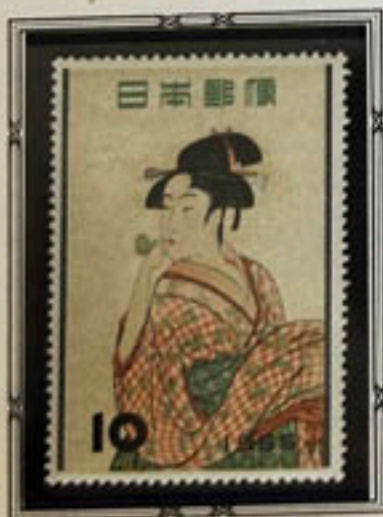
"A Girl Blowing a Glass Toy"

This stamp commemorates the 150th anniversary of the death of Utamaro, the famous Japanese woodcut artist, and was released for Philatelic Week, 1955.