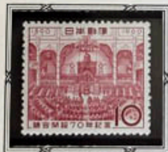
Opening of First Session

The first session of the Imperial Japanese Diet was opened on November 29, 1960. In commemoration of the seventieth anniversary, this set of two stamps was released December 24, 1960.