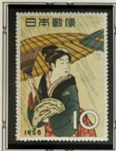
"Woman with Umbrella"

Released for the fifth International Congress of Diseases of the Chest and the seventh International Congress of Bronchoesophology.