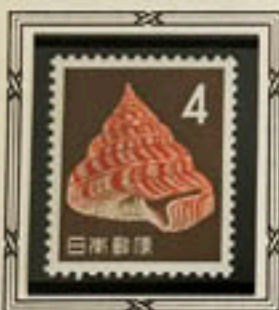
Beniokinaebisu — Shell

This regular issue 4-yen stamp, used mostly for fourth class mail, features a beniokinaebisu found in the Bay of Tosa and off Goto Islands. It is much sought after for its beauty.