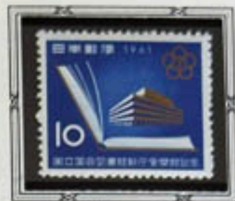
Diet Library and Book

Issued to commemorate the opening of the new modern building of the National Diet Library. Located on a site near the Diet Building at Nagatacho, Chiyoda-ku, Tokyo, it is considered the third largest library in the world.