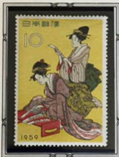
"Women Reading Poetry"

To mark Philatelic Week, 1959, which began on May 20, this stamp was issued. The design features ladies reading a poem and is the work of Eishi Hosoda (1756-1829), a Ukiyoe artist of the Edo period.