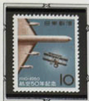
Biplane & Jet