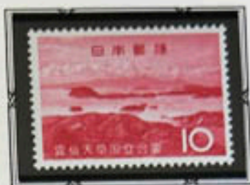
Amakusa Island and Mt. Unzen

Originally designated as Unzen National Park on March 16, 1934, its bounds were enlarged on July 20, 1956 to include part of Amakusa Islands under the new name of Unzen-Amakusa National Park. It covers an area of 25,600 hectares and is one of Japan's most beautiful.