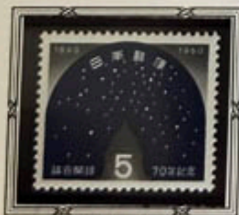
Diet Building by Night