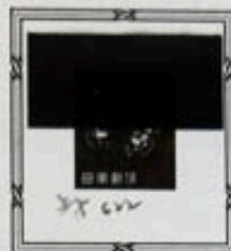
Big Purple Butterfly