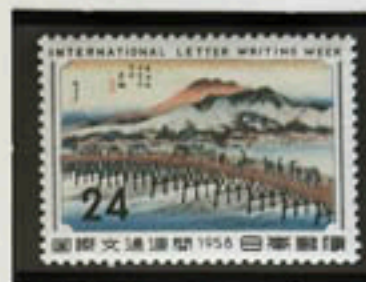
"Kyoto," Print by Hiroshige

Commemorating International Letter Writing Week, October 5-11, 1958.