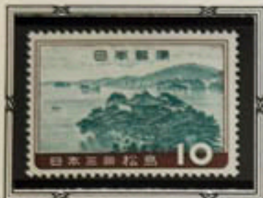
Bay of Matsushima