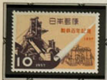
Ancient & Modern Blast Furnaces

The centenary of the Japanese iron industry was commemorated by the issue of this 10 yen stamp.