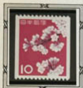
Cherry Blossoms 5 yen