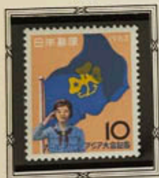
Girl Scout and Flag

An assemblage of girl guides and girl scouts from our around the world took place in Japan on August 1st at Togakushi Heights, Nagano Prefecture.