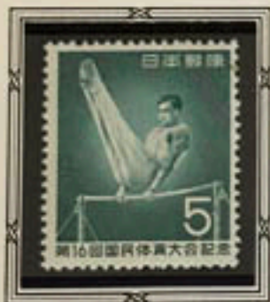
Gymnast on Horizontal Bar

Issued to commemorate the opening of the new modern building of the National Diet Library. Located on a site near the Diet Building at Nagatacho, Chiyoda-ku, Tokyo, it is considered the third largest library in the world.