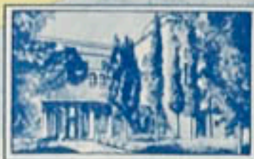
HEBREW UNIVERSITY OF JERUSALEM