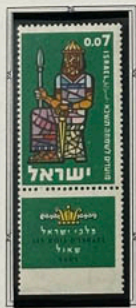
Kings of Israel, Saul