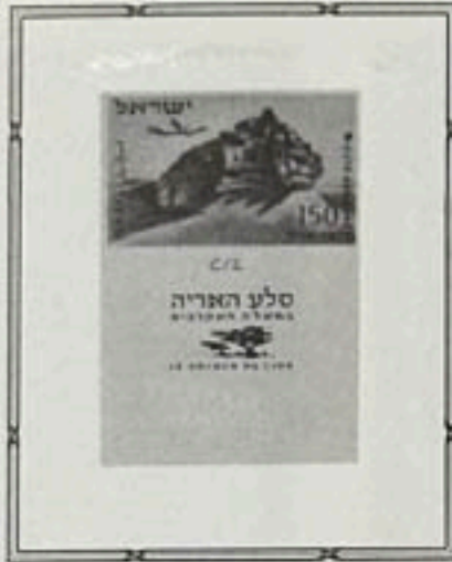
The Lion Rock at the Scorpion Post