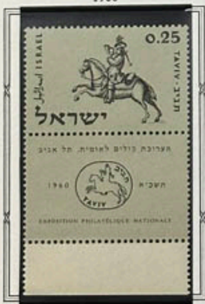
National Stamp Exhibition, Tel Aviv, TAVIV 1960