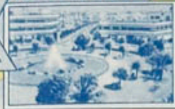
MODERN TEL AVIV