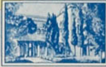
HEBREW UNIVERSITY OF JERUSALEM