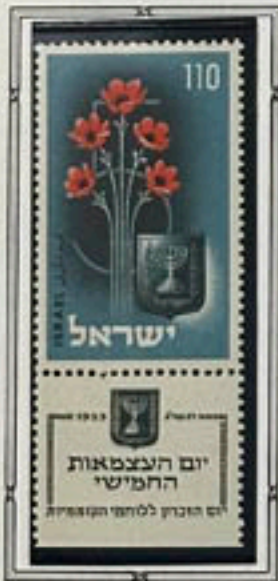
Memorial Anniversary in honour of the Fighters for Freedom.