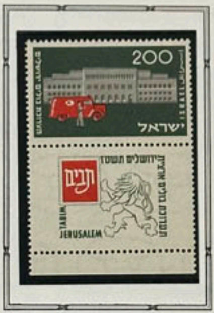
Tabim Jerusalem National Stamp Exhibition