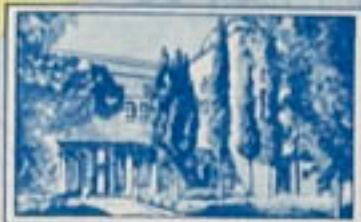
HEBREW UNIVERSITY OF JERUSALEM