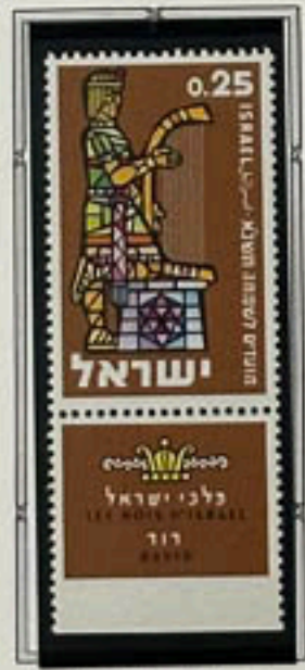
Kings of Israel, David