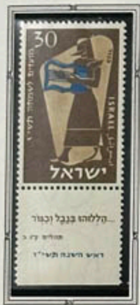
... Praise him with the psaltery and harp. Psalms 150, 3