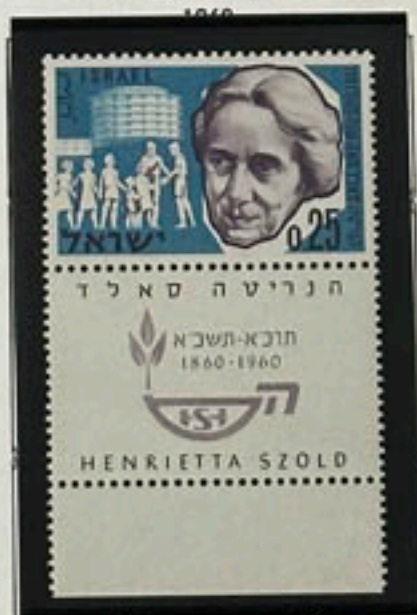
Henrietta Szold 1860-1960