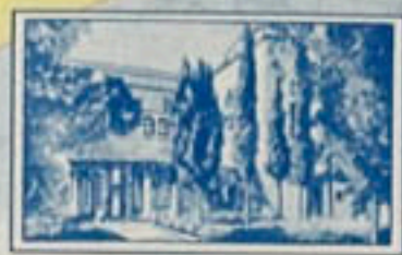
HEBREW UNIVERSITY OF JERUSALEM