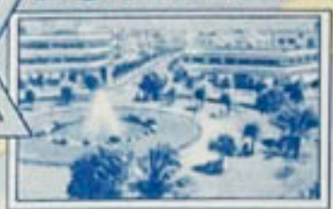
MODERN TEL AVIV