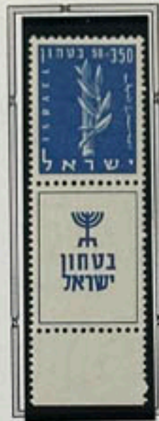
Defense (Security) of Israel.