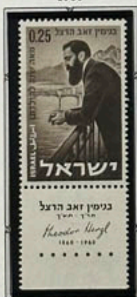
Theodore Herzl 1860-1960