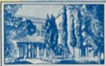
HEBREW UNIVERSITY OF JERUSALEM