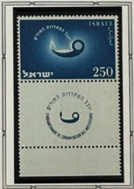
Jubilee of the Teachers' Organization