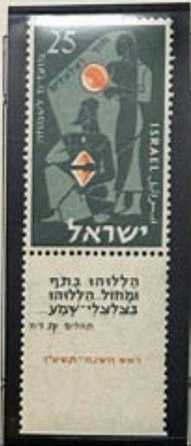
Praise him with the timbrel . . .