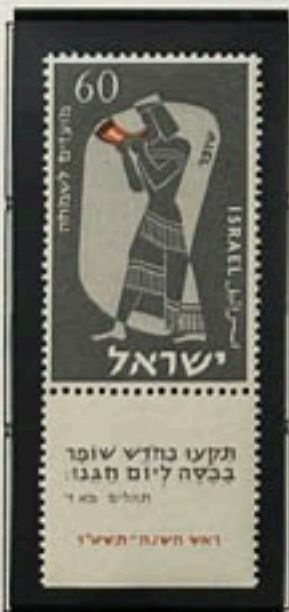
Blow up the horn in the new moon