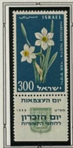
Independence Day 1959, Remembrance Day for the victims of the War of Liberation