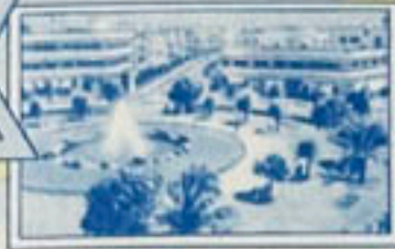
MODERN TEL AVIV