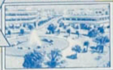
MODERN TEL AVIV