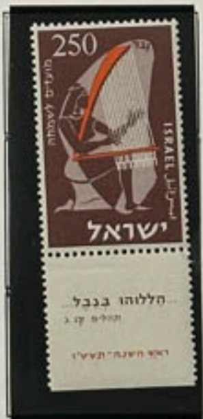
. . . with the harp.