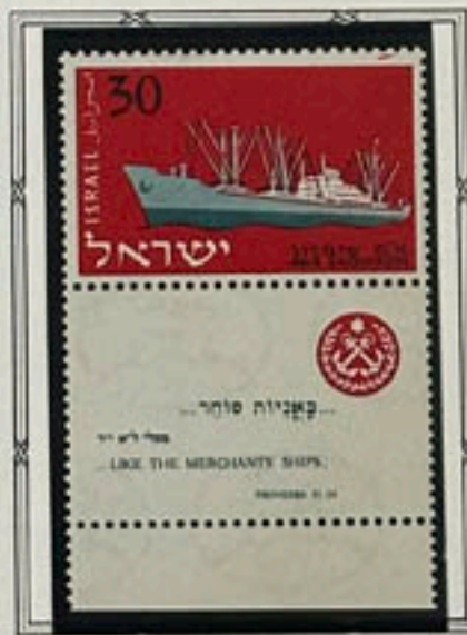
"... Like the Merchants' Ships . . ." Proverbs 31:14.