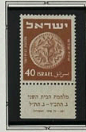
The war of Bar Kochba 132-135 C.E.