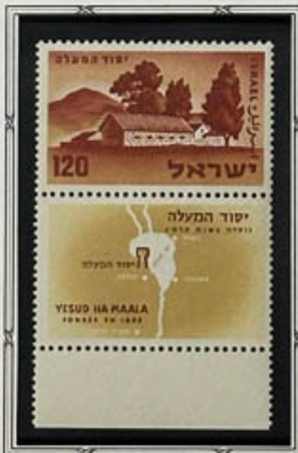
Yesud Ha-Ma'ala, founded in 1883