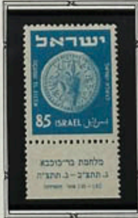
The war of Bar Kochba 132-135 C.E.