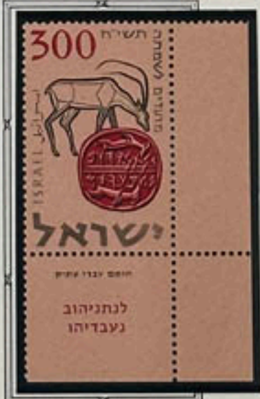
Belonging to Netunyahuv Ne'avodyahu.