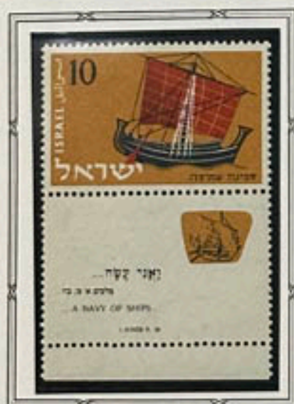
"... A navy of ships . . ." 1 Kings 9:26.