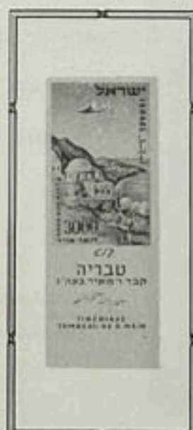
Tiberias, tomb of Rabbi Meir