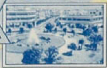
MODERN TEL AVIV