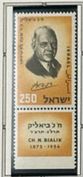
Ch. N. Bialik, 1873-1934