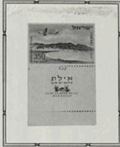
Eilat on the coast of the Red Sea