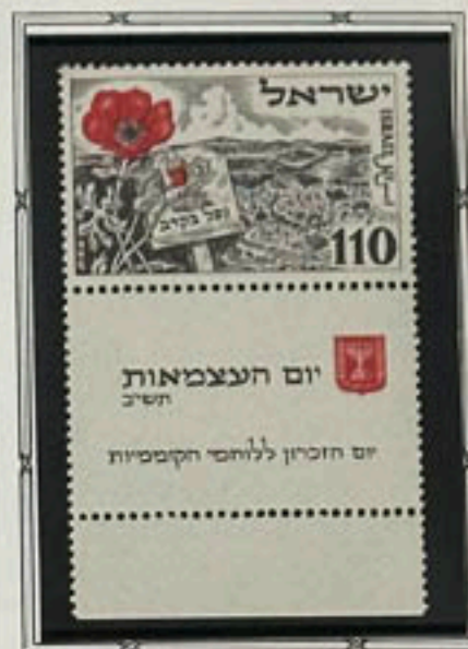
Independence Day 1952 Memorial Anniversary in honour of the Fighters of Freedom.