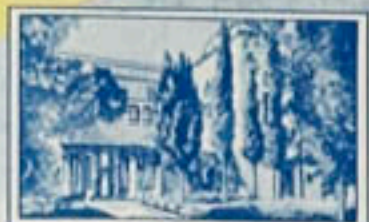
HEBREW UNIVERSITY OF JERUSALEM