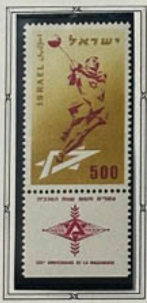
Twenty-fifth anniversary of the Maccabiah