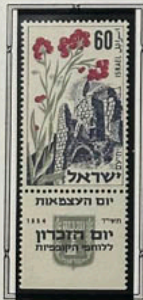
Independence Day 1954 Memorial Anniversary in honour of the Fighters for Freedom