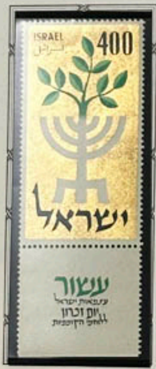
10th Year of Independence Remembrance Day for the Fighters of Liberation.