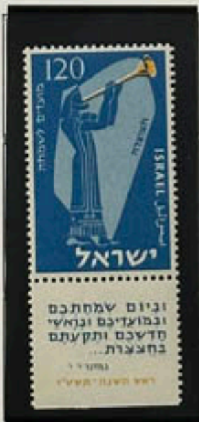
ye shall blow with the trumpets . . .