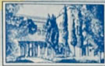
HEBREW UNIVERSITY OF JERUSALEM