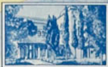
HEBREW UNIVERSITY OF JERUSALEM