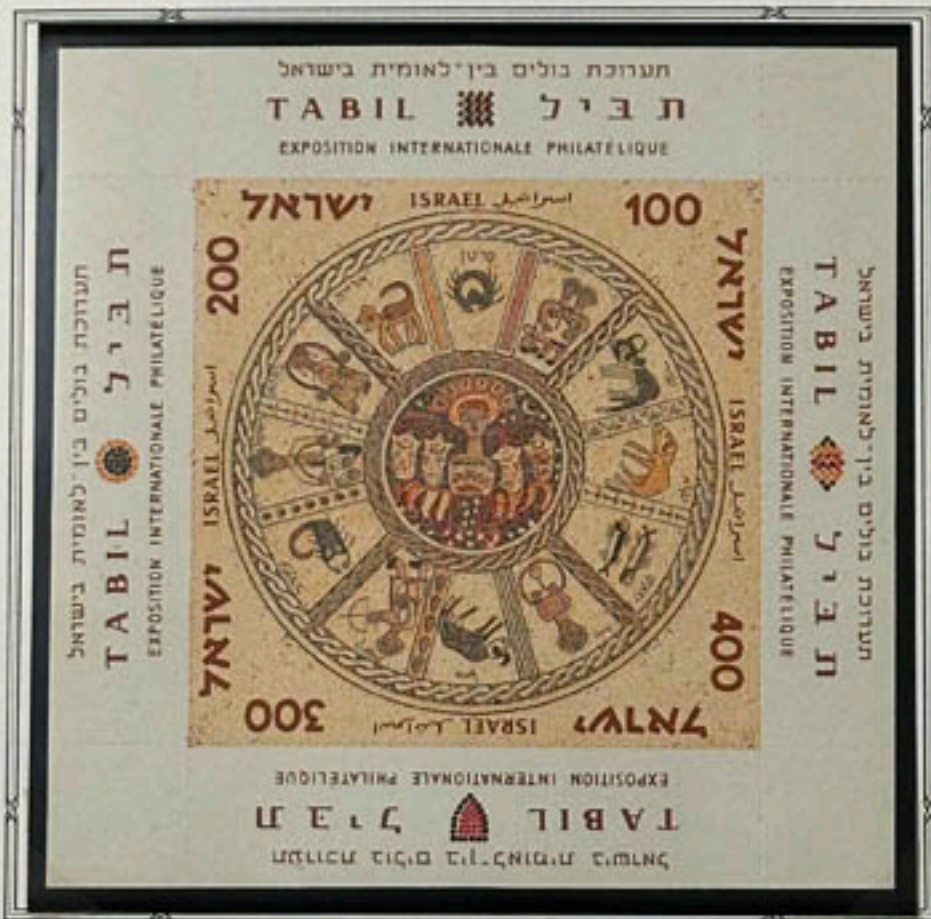
Tabil International Philatelic Exhibition