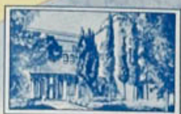
HEBREW UNIVERSITY OF JERUSALEM