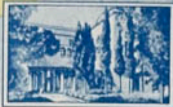
HEBREW UNIVERSITY OF JERUSALEM