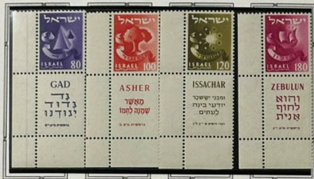
Gad, a troop shall overcome him (Genesis, 49, 19)