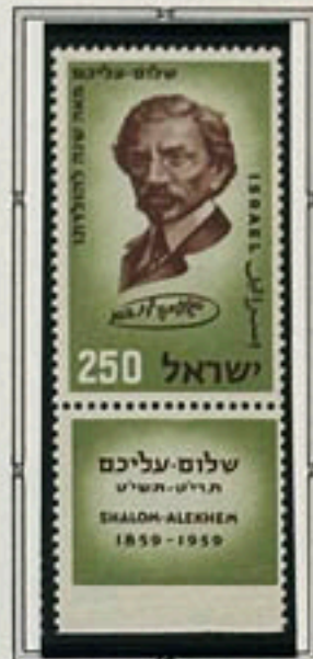
Shalom - Alekhem, 1859-1959