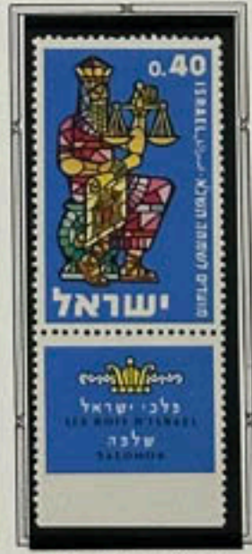
Kings of Israel, Solomon