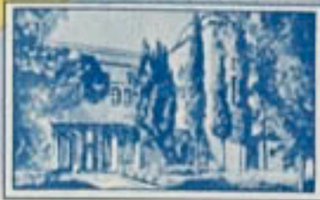
HEBREW UNIVERSITY OF JERUSALEM