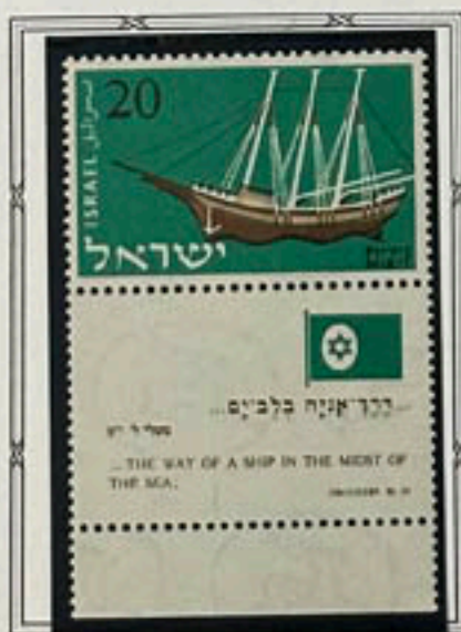
"... The way of a ship in the midst of the sea . . ." Proverbs 30:19.