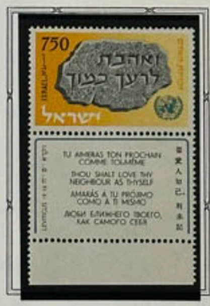
"Thou shalt love thy neighbor as thyself" Leviticus 19:18.