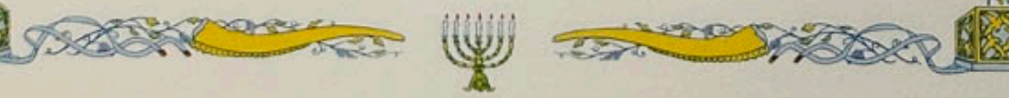
First World Congress of Jewish Youth