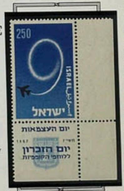
Independence Day 1957 Memorial Day for the fighters for independence.