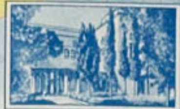
HEBREW UNIVERSITY OF JERUSALEM