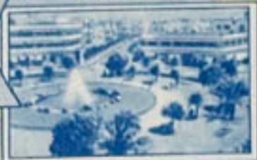
MODERN TEL AVIV