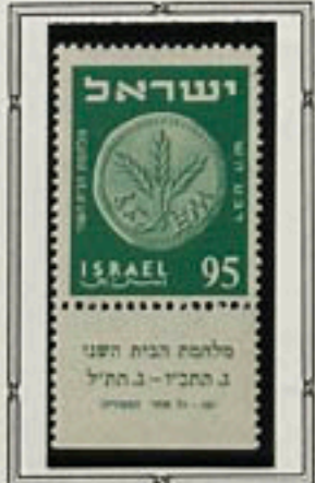
War of the Second Temple