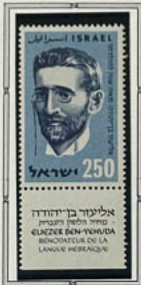
Eliezer Ben-Yehuda, the redeemer of the Hebrew language