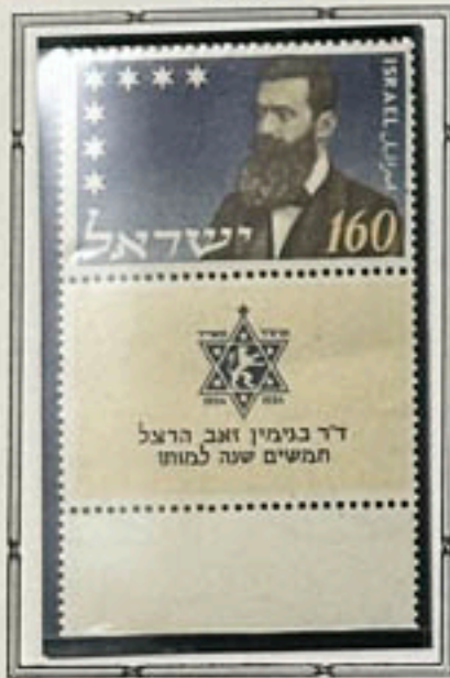
1904-1954 Dr. Benjamin Zeev Herzl Fifty years since his death