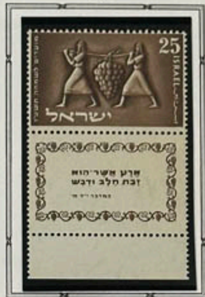
Land floweth with milk and honey Numbers 14:8