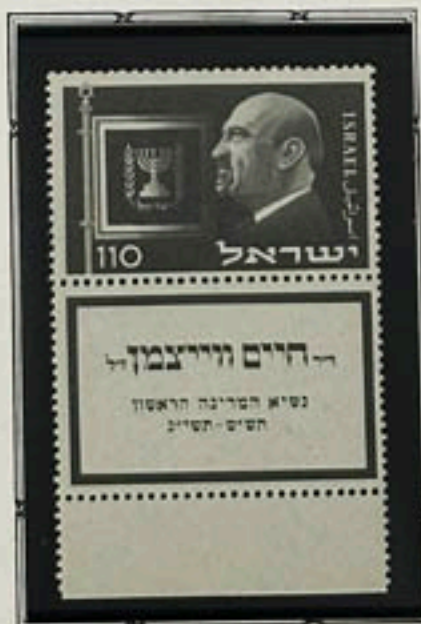
Dr. Chaim Weizmann of blessed memory First President of the State 1949-1952