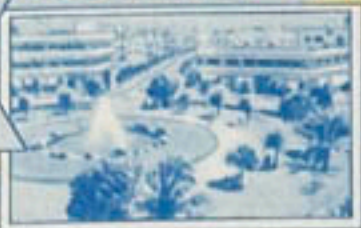
MODERN TEL AVIV