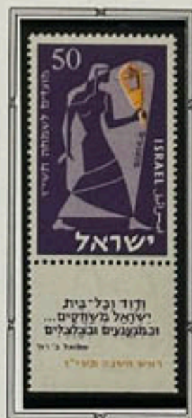
... and David and all the House of Israel played ... and on timbrels, and on cornetts. 2 Samuel 6, 5