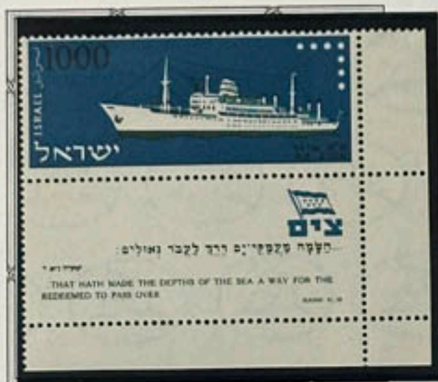
"That hath made the depths of the sea a way for the redeemed to pass over . . ." Isaiah 51:10.