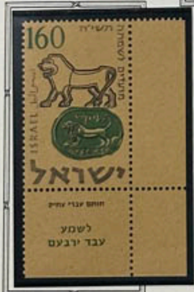
Belonging to Shema, the servant of Jeroboam.