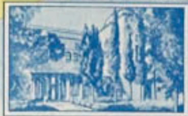
HEBREW UNIVERSITY OF JERUSALEM