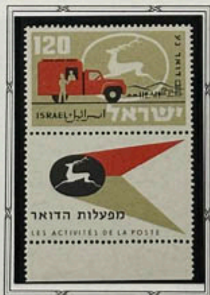
The activities of the Post