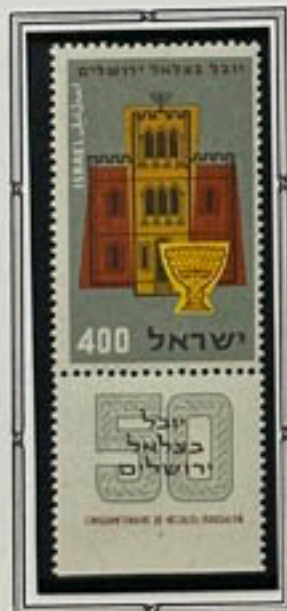
50th Anniversary of Bezalel, Jerusalem.