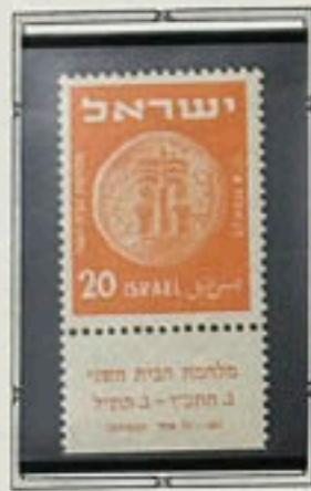
The war of the second Temple 66-70 C.E.