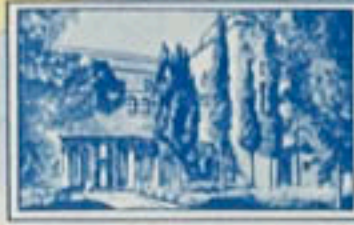
HEBREW UNIVERSITY OF JERUSALEM