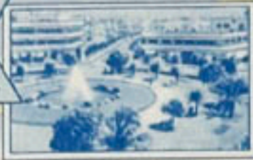
MODERN TEL AVIV