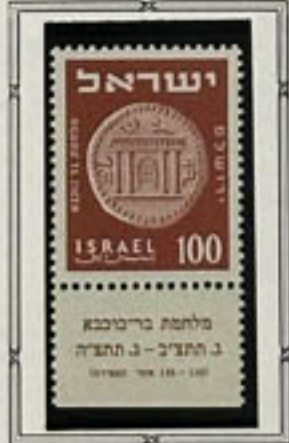
War of Bar Kechba