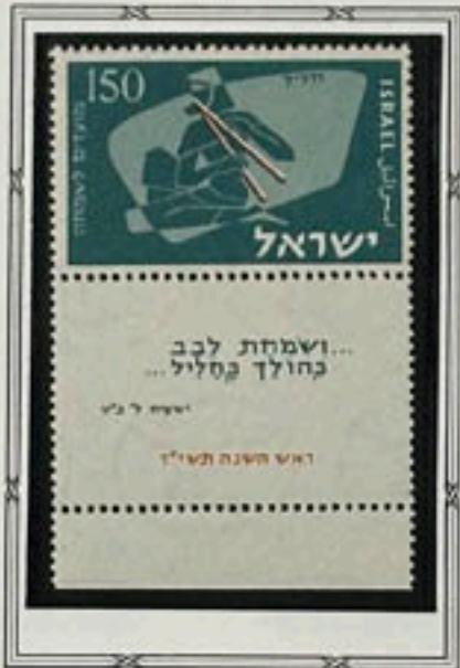
... And gladness of heart ... when one goeth with a pipe. Isaiah 30, 29.