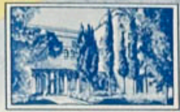
HEBREW UNIVERSITY OF JERUSALEM