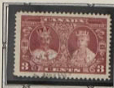
King George V and Queen Mary