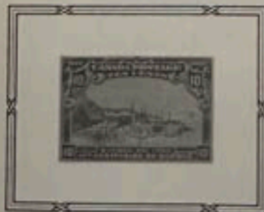
Quebec in 1700