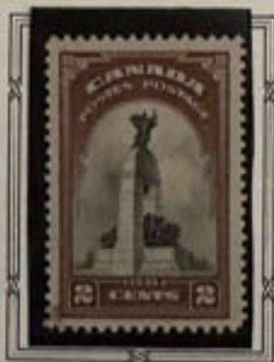
War Memorial, Ottawa