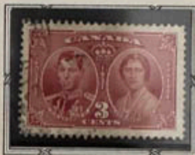
King George VI and Queen Elizabeth

When his brother, King Edward VIII, abdicated in order to marry Wallis Warfield Simpson, Prince Albert (Duke of York) ascended the throne as King George VI. This stamp marks his coronation on May 12, 1937.