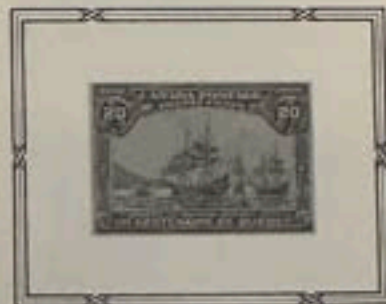
Cartier Arrives in Quebec

Where the St. Lawrence River narrows at Quebec City, French explorer Jacques Cartier in 1535 came upon an Indian village called Stadacona. But no attempt was made to establish a permanent European settlement at this spot until the start of the seventeenth century. By this time fur hats had become the fashion in Europe, increasing the demand for beaver pelts and renewing French interest in North America. Samuel de Champlain founded the first permanent European settlement at Quebec in 1608. It remained French until 1759, when the British won the battle of the Plains of Abraham.