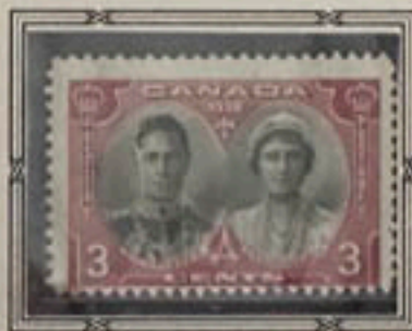
King George VI and Queen Elizabeth

King George VI was the first reigning monarch of Canada actually to visit that country.