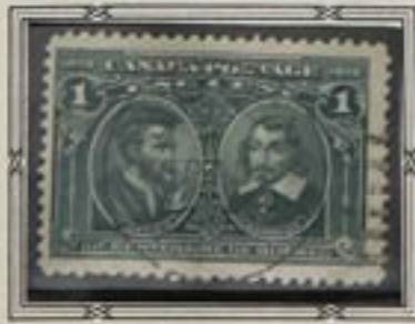
Jacques Cartier and Samuel Champlain