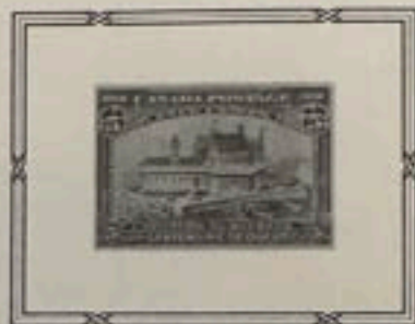
The Champlain Home, Quebec