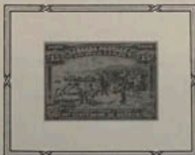
Champlain's Departure for West