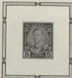
Edward, Prince of Wales