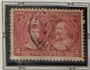
Queen Alexandra and King Edward VII