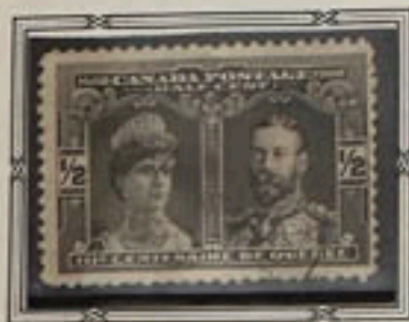
Princess and Prince of Wales