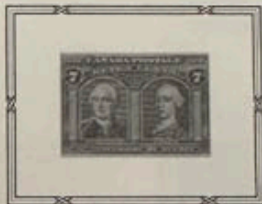
Generals Montcalm and Wolfe