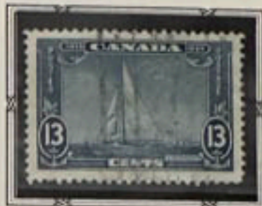
Royal Yacht "Britannia"

The twenty-fifth anniversary of the accession of George V to the British throne is commemorated by this set of stamps issued on May 4, 1935. The eldest son of King Edward VII, he ascended the throne on May 6, 1910 and reigned until 1936. The Prince of Wales succeeded his father, reigning briefly as Edward VIII.