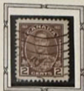
Duke of York