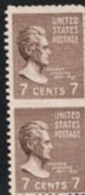
Missing But Not Imperf.