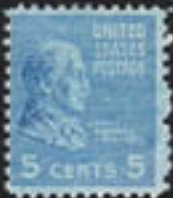
Plates Poorly Wiped During Printing Process