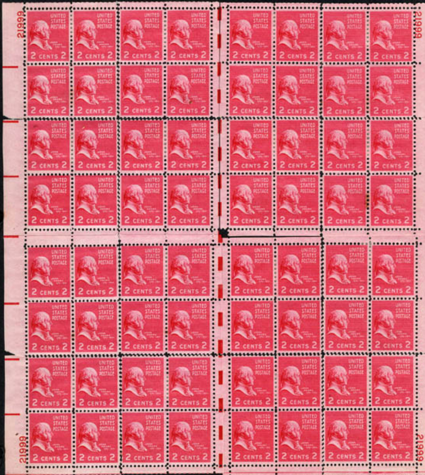
PLATE LAY OUT EYE PLATE