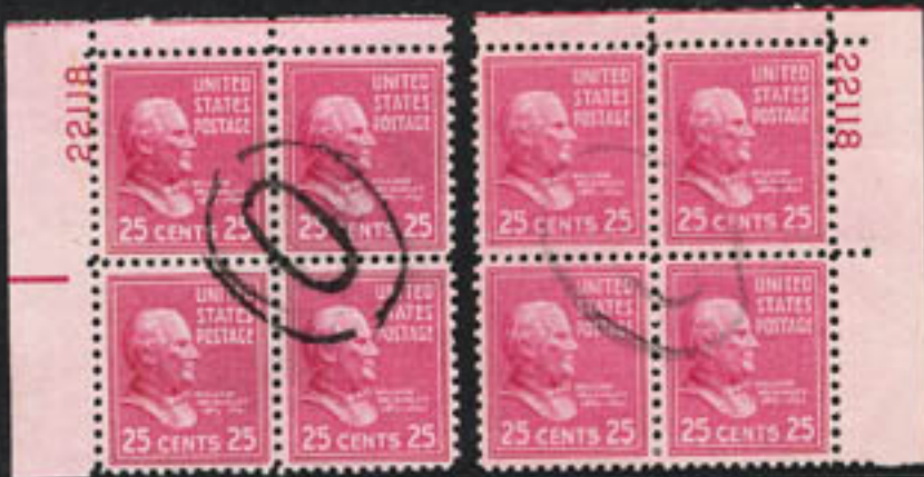
Matched Set PL #