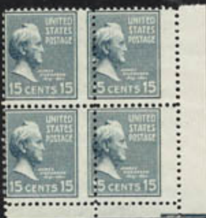
Ink Ran Out During Printing